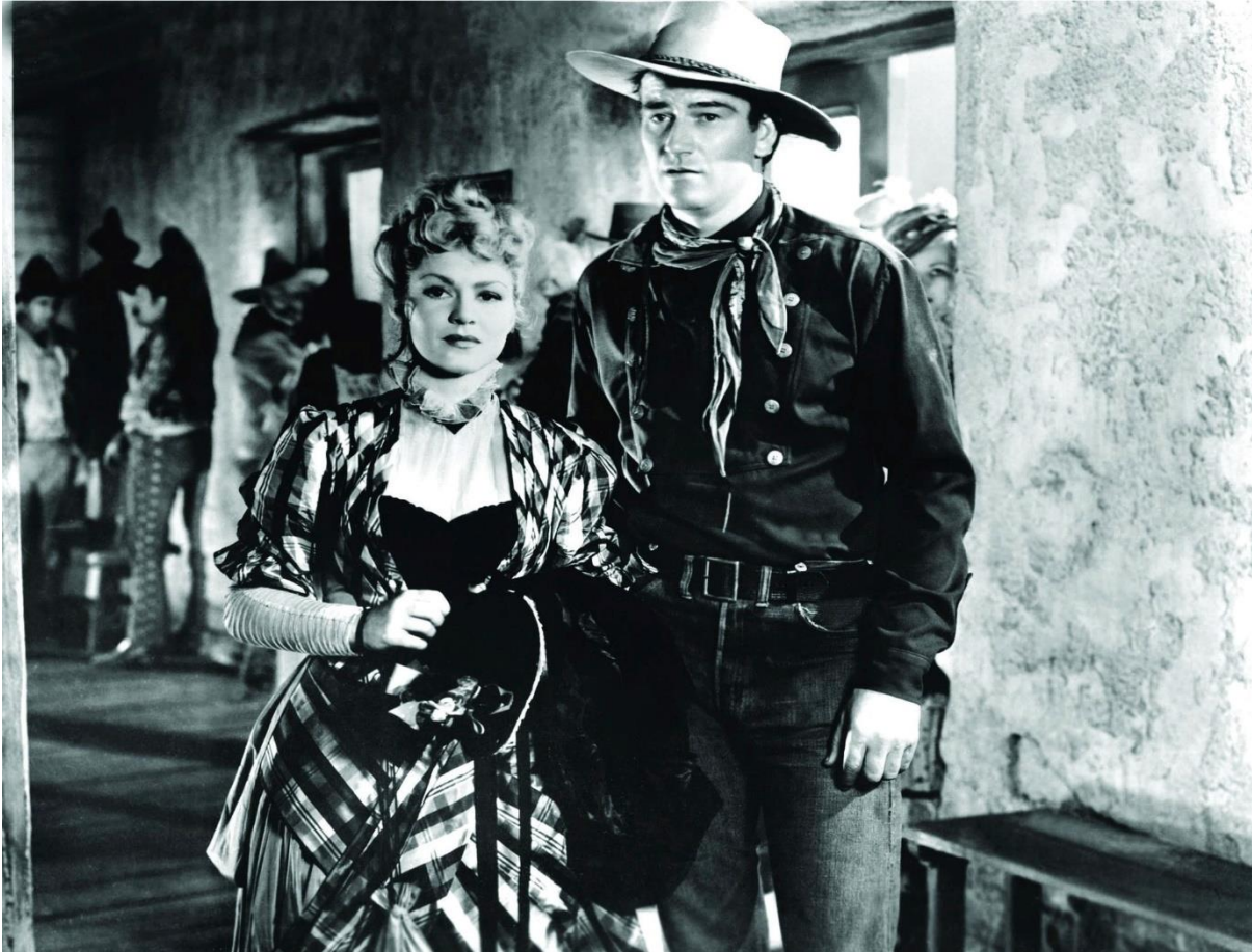
Figure 1. Dallas and Ringo

the embodiment of a second chance, something young people in 1939 longed for due to the harsh economical situation that The Great Depression has put them through. Her character was proof that no matter the hardship somebody goes through, there is always hope for a happy ending, one she had after escaping to Mexico with Ringo.