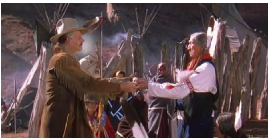
Figure 2. Captain Nathan Brittles and chief Pony that Walks

Unlike former Native American stereotypes, the leader of the Arapaho tribe, an elderly chief named Pony that Walks is shown as captain Brittle's old friend.