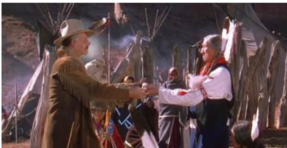
Figure 2. Captain Nathan Brittle's and chief Pony that Walks

Unlike former Native American stereotypes, the leader of the Arapaho tribe, an elderly chief named Pony that Walks is shown as captain Brittle's old friend.