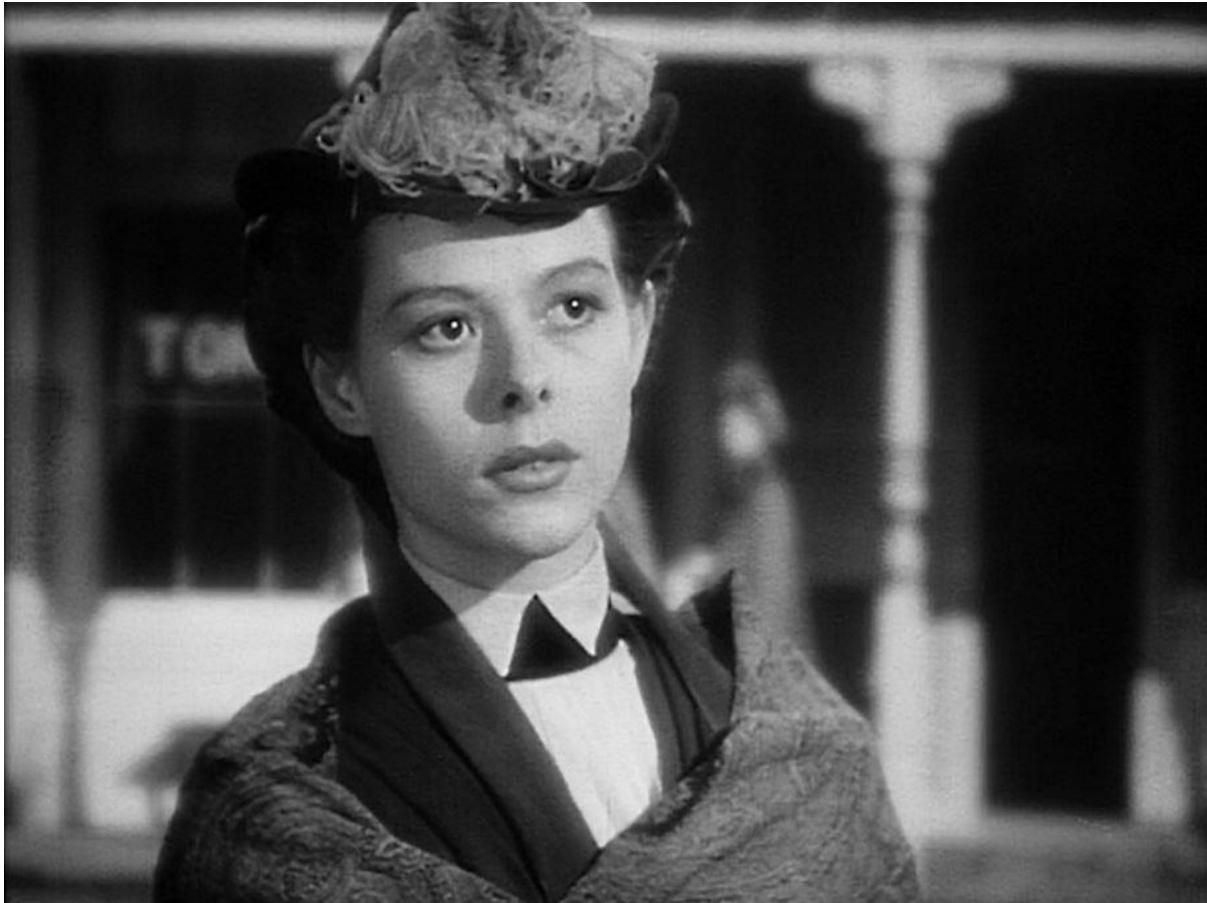
Figure 2. Lucy Mallory in Stagecoach (1939)

the stereotype of a virtuous lady that follows traditional social norms and embodies virtue, grace and purity, and as a self-sacrificing woman that is devoted to her family. As mentioned before, most Westerns have a damsel in distress, which in this case is the pregnant Lucy Mallory that is in desperate need of protection by the male characters.