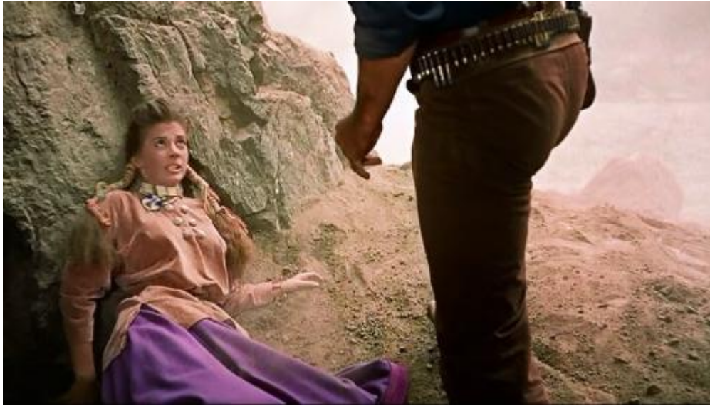
Figure 3. Ethan considering killing his niece Debbie

Other than chief Scar, other Native Americans in the film are portrayed in the usual Fordian manner, as brutal savages that are an imminent threat to the Anglo-American population. At the beginning of their quest, Ethan and Martin first find Lucy, Debbie's older sister who was raped and brutally murdered by Indians. Despite Ethan's hatred for the Indians, he and Martin are forced to collaborate with them in order to obtain goods and information about the whereabouts of Debbie. In one such instance Martin encounters a young captive Indian girl who he decides to rescue from the Comanche raiding party. The girl named Look then follows Martin throughout the journey and develops an interesting relationship with him. Their relationship is a symbol of obstacles that individuals from different cultural backgrounds encounter in a relationship, such as language, religion and traditions. Nevertheless, their relationship is an exploration of cultural challenges, identity and finally, acceptance. Despite the language barrier which prevents them from communicating normally and different cultural upbringing they had, the two form a special relationship in which they are dependent on each other.