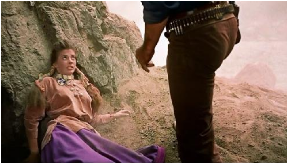
Figure 3. Ethan considering killing his niece Debbie

Other than chief Scar, other Native Americans in the film are portrayed in the usual Fordian manner, as brutal savages that are an imminent threat to the Anglo-American population. At the beginning of their quest, Ethan and Martin first find Lucy, Debbie's older sister who was raped and brutally murdered by Indians. Despite Ethan's hatred for the Indians, he and Martin are forced to collaborate with them in order to obtain goods and information about the whereabouts of Debbie. In one such instance Martin encounters a young captive Indian girl who he decides to rescue from the Comanche raiding party. The girl named Look then follows Martin throughout the journey and develops an interesting relationship with him. Their relationship is a symbol of obstacles that individuals from different cultural backgrounds encounter in a relationship, such as language, religion and traditions. Nevertheless, their relationship is an exploration of cultural challenges, identity and finally, acceptance. Despite the language barrier which prevents them from communicating normally and different cultural upbringing they had, the two form a special relationship in which they are dependent on each other.