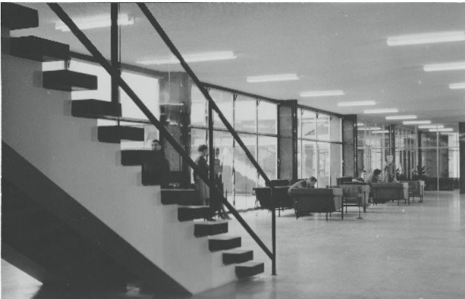
Figure 6. Interior of Moša Pijade Workers' University in Zagreb (1961), corridors with the “islands for rest” (source: Library of the Public Open University Zagreb, photo: Željko Krčadinac).

The total surface of 20,000 m 2 was designed as a small city for around 5,000 daily visitors. Within the complex, spaces include inner streets and squares, open inner courtyards, halls and classrooms. Each space is given its own specific meaning by its position, use and fittings, but above all by its relationship to other spaces, to the whole and to the content of the site. The corridors, pathways and foyers play a key role as multifunctional spaces for communication. Special attention was paid to the “islands for rest” that were carefully distributed throughout the building (Figure 6). The purpose of shaping transparent spaces was to achieve an atmosphere and emotional quality whereby workers and visitors could feel “at home”. Nikšić defined the main idea of architectural design as a space–time concept, undoubtedly evoking Siegfried Giedion’s theory set forth in his influential book Space, Time, Architecture , first published in 1941 (Nikšić 1958). The spaces were vertically connected with several freely situated stairways, forming a “continuous” floating space.