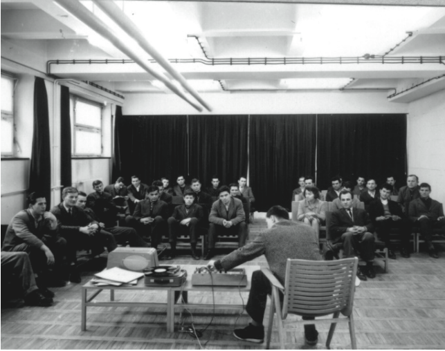
Figure 10. Interior of Moša Pijade Workers' University in Zagreb (1961), music education (source: Library of the Public Open University Zagreb,).