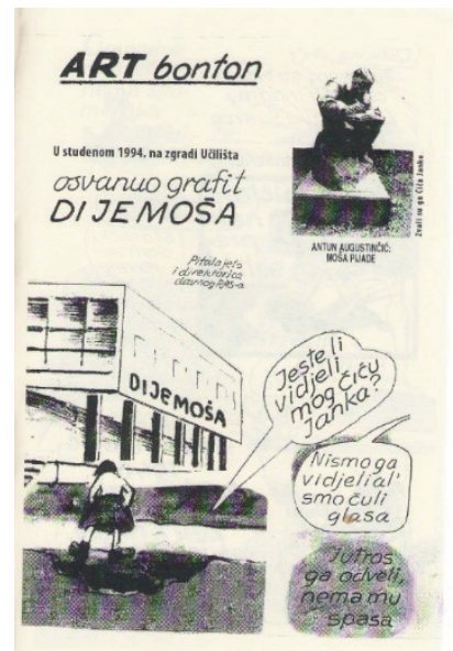
Figure 11. Illustration by Predrag Mihok in Željko Obad's book The Moša Pijade Ranch (Obad 2015: 149).

came Pučko (Public) and Otvoreno (Open). Meanwhile, the Street of the Proletarian Brigades, where the institution is located, was renamed Vukovar Street. 17 The sculpture called the Moša Pijade Monument, which was the work of Antun Augustinčić, was removed in 1993. 18 The removal prompted a public reaction, and in 1994 graffiti appeared asking “ di je Moša [Where’s Moša]”. This was recorded in oral, written and visual forms, as former employee Ružica Kovačević used this question as the title of an article opening an issue of 15 Days focused on the institution (Kovačević 2011), and former employees Željko Obad and Predrag Mihok presented their interpretation of the event in a comic strip called “Art bonton” (Figure 11). 19