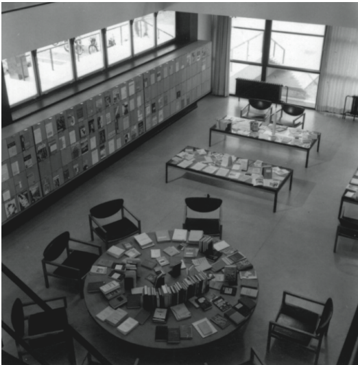
Figure 7. Interior of Moša Pijade Workers' University in Zagreb (1961), Bernardo Bernardi, round table and A4 chairs in the ground floor reading room.

accordance with what the space would be used for). According to the principle of synthesis, Bernardo Bernardi designed all of the interior fittings, which created an organic whole of highly individualized spaces that could be easily modified. In addition to the educational units, the space included a large library with a reading room and a documentation centre (Figure 7), editorial offices for ambitious publishing activities with printing facilities and numerous additional activities. Special attention was paid to the design of the two multifunctional auditoriums, one with 600 seats (Figure 8) and the other with 220, planned for conferences, concerts, theatrical performances and film screenings. The cultural education programmes were particularly interesting and ranged from introductory to more advanced courses. The visual arts syllabi focused on understanding and experiencing art and included art history, modern and contemporary art, and architecture and design.