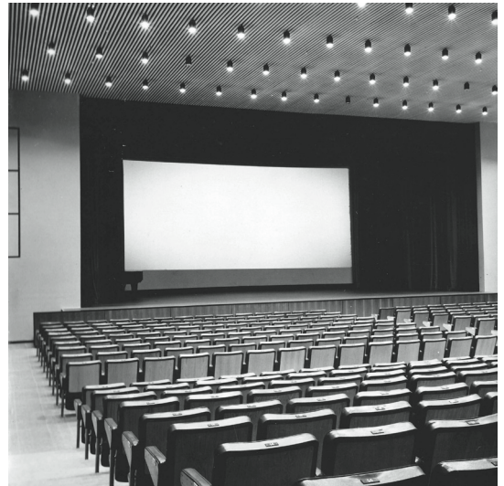
Figure 8. Interior of Moša Pijade Workers' University in Zagreb (1961), Great Hall.

An optimal space was created through a study of teaching methods: a “seminar” unit for a group of 15–20 participants. Instead of rigid classrooms, the interiors were designed according to individualised and dynamic teaching methods and programmes and fitted with modular furniture and fittings that could be arranged in various combinations, which enabled direct and more democratic communication within a group (Figure 9). Thus teaching models and educational programming generated the building's spatial structure based on a spatial module of 7x7 metres.