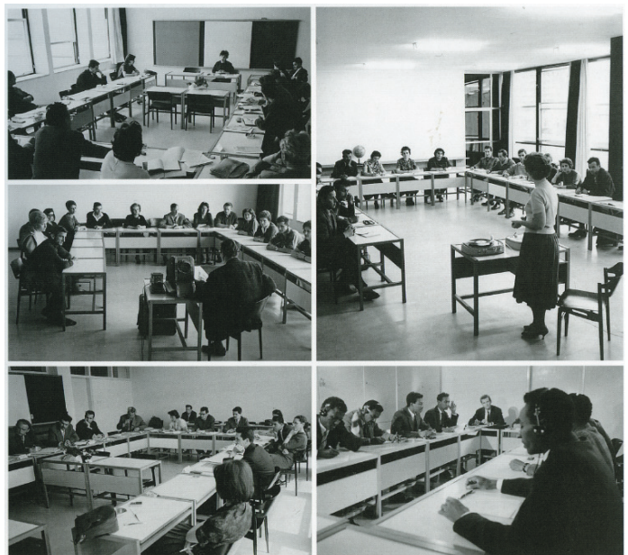
Figure 9. Interior of Moša Pijade Workers' University in Zagreb (1961), spatial module — a seminar room with desks that could be easily moved around to accommodate different teaching methods.