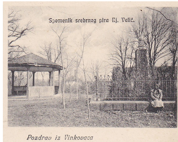
7 Monument to the Silver Wedding Anniversary of Emperor Franz Joseph I and Elisabeth, Vinkovci, 1879, undated postcard. City Museum, Vinkovci, Collection of Postcards, Old Photos and Drawings P3125

It seems that the original site of the monument was chosen to mark the border between the Triune Kingdom of Croatia, Slavonia and Dalmatia and the Military Frontier, and to stress the fact that both of these provinces were loyal to the emperor. The monument was later moved closer to the centre of Vinkovci, to a park called Lenije. 36 It was a truncated obelisk in shape. As this paper shows, many monuments erected in Croatia in the nineteenth and early twentieth centuries took the form of an obelisk, which probably reflects the practice in the central regions of Austria-Hungary, in which numerous monuments of this kind were erected (e.g., so-called Austrian Monument in Kulm [1825], Adalbert Stifter Monument above Lake Plöckenstein/Plešné [1876/77], the Emperor's Obelisk on the Stilfserjoch/Stelvio Pass between South Tyrol and Lombardy [1888], Liebenberg Monument [1887–1890] and Hesser Monument [1909] in Vienna, etc.). The coat of arms of the Triune Kingdom stood on top of the Vinkovci obelisk, and above it the Hungarian crown. Today the coat of arms (but without the Hungarian crown) is the only surviving remnant of the monument (together with some pieces of stone standing on the site of the monument), while the rest was destroyed in 1918. 37