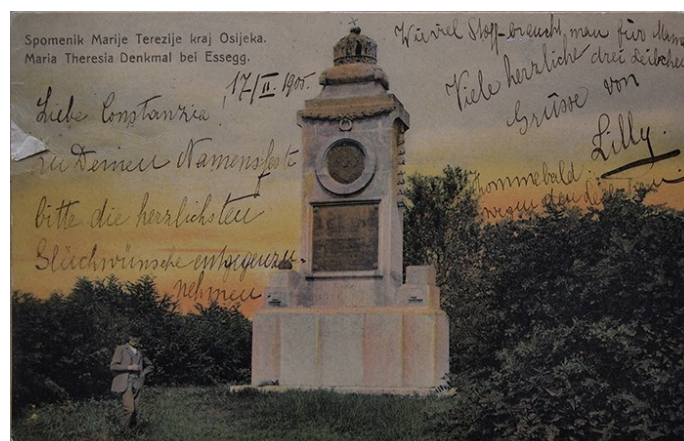
5 Monument to Maria Theresia and Joseph II, erected in Osijek in 1779, postcard. State Archives in Osijek, collection of postcards (photo © State Archives in Osijek)