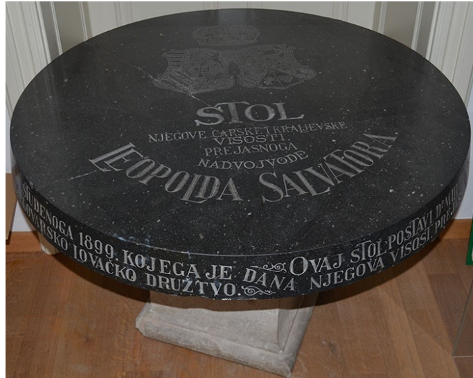
16 Memorial table built in 1903 in the Jasik Forest near Bjelovar, commemorating the pheasant hunt of Archduke Leopold Salvator in this forest in 1899. Bjelovar City Museum, Cultural-Historical Department, Collection of Furnishing, Inv.-Nr 1608