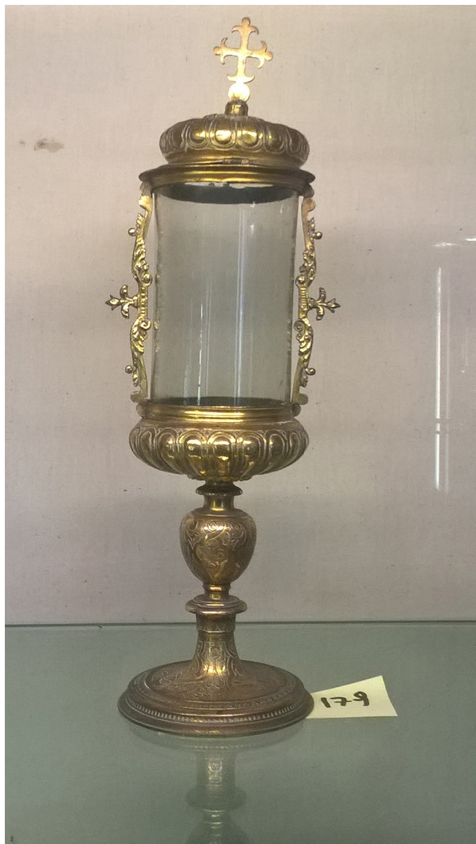
Fig. 7. Reliquary, Museo diocesano d'arte sacra Sant'Apollonia, Venice