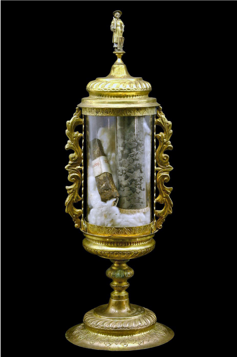
Fig. 8. Reliquary of St Lawrence, Collection of sacral art at the parish church of St Blaise, Vodnjan (< http://zupavodnjan.com >)