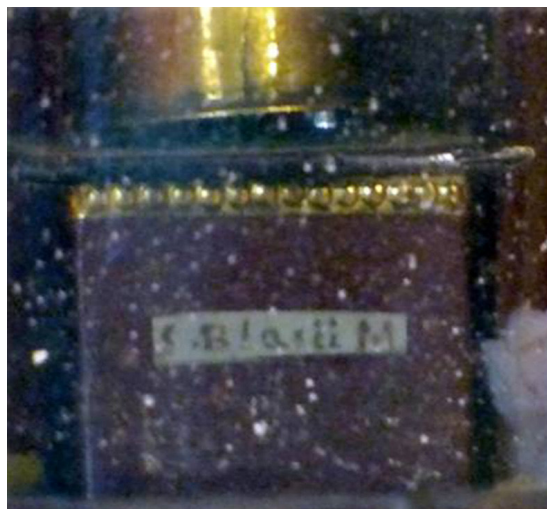
Fig. 6. Inscription Sancti Blasii Martyris on the reliquary of St Blaise