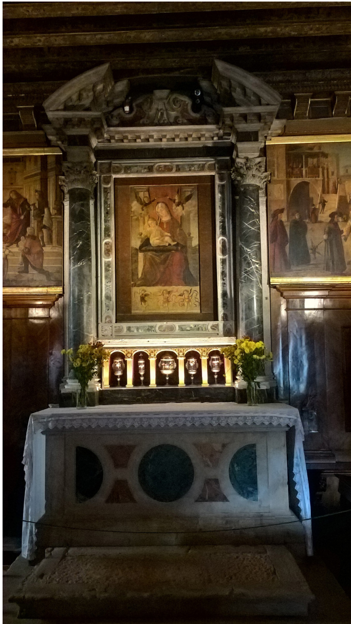
Fig. 2. Altar in the lower hall of the Scuola di S. Giorgio degli Schiavoni