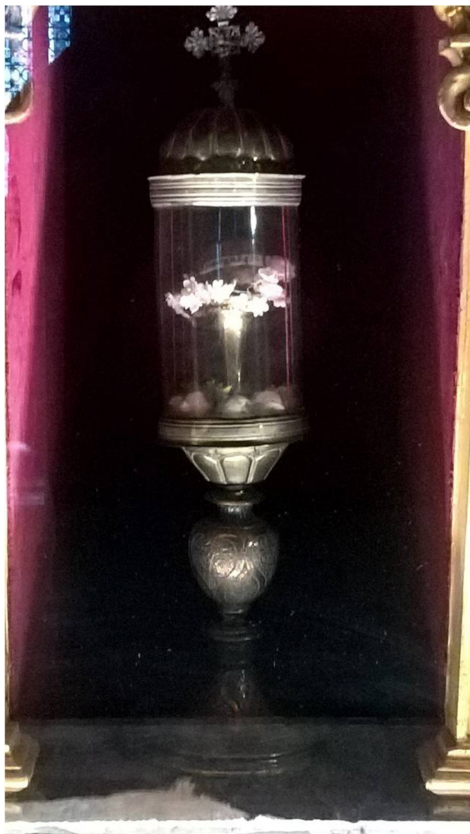
Fig. 4. Reliquary of St George in the Scuola