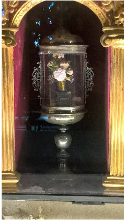
Fig. 5. Reliquary of St Blaise in the Scuola