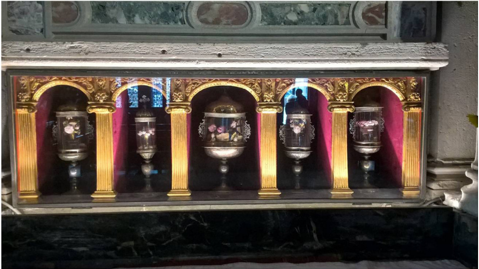
Fig. 3. Reliquary-predella of the altar in the lower hall of the Scuola