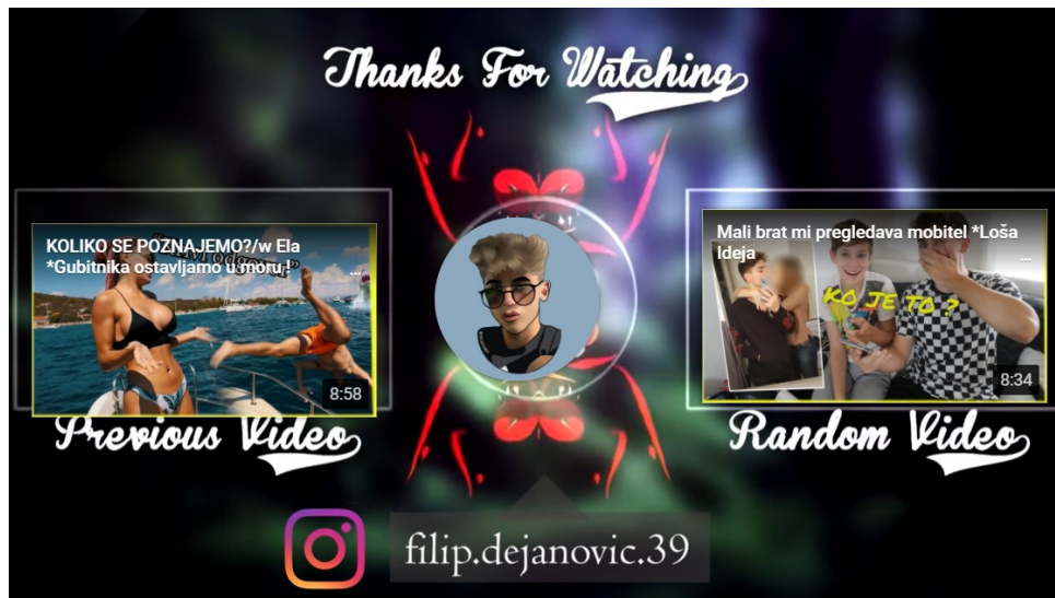
Image 5. TheSikrt's ending scene