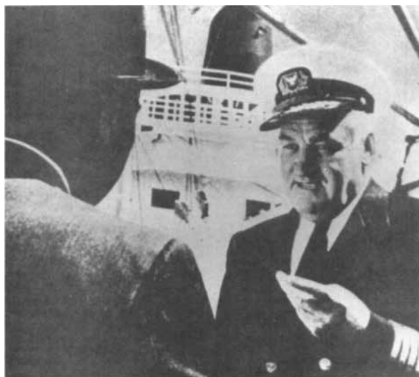
Figure 1. Example of an image used in the Thematic Apperception Test

The test consists of black-and-white images showing different people in several ambiguous situations. For each measurement, it is important to select the images that arouse the assessed motive. It is usually recommended to use between four and eight images per measurement (Schultheiss and Pang, 2007) and appropriate selection of pictures for power motive according to Smith (1992) are pictures like ship captain, two women in lab coats in a laboratory or a trapeze artist. An example of such an image used for power motive measurement is shown in Figure 1. The respondents' task is to construct a story about each image that will describe what has led to the situation in the picture, what is happening now, what will happen in the future and what people in the picture think or feel.