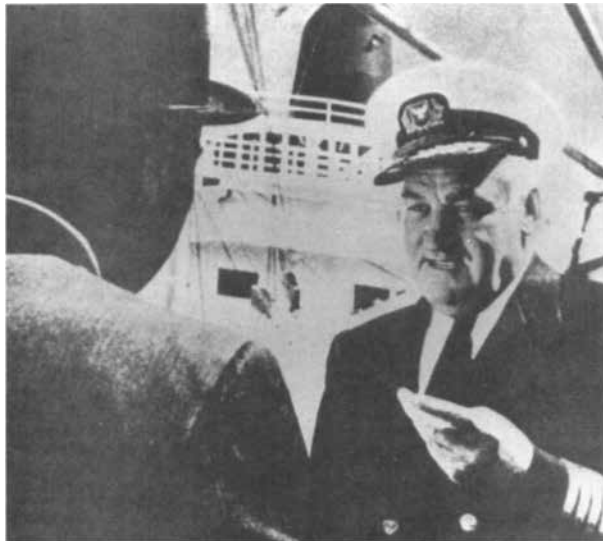
Figure 1. Example of an image used in the Thematic Apperception Test

The test consists of black-and-white images showing different people in several ambiguous situations. For each measurement, it is important to select the images that arouse the assessed motive. It is usually recommended to use between four and eight images per measurement (Schultheiss and Pang, 2007) and appropriate selection of pictures for power motive according to Smith (1992) are pictures like ship captain, two women in lab coats in a laboratory or a trapeze artist. An example of such an image used for power motive measurement is shown in Figure 1. The respondents' task is to construct a story about each image that will describe what has led to the situation in the picture, what is happening now, what will happen in the future and what people in the picture think or feel.