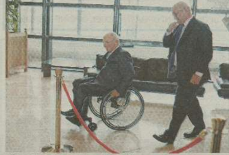
Njemački ministar financija Wolfgang Schäuble još se nije izjasnio o najavama francuskog kolege Michela Sapina