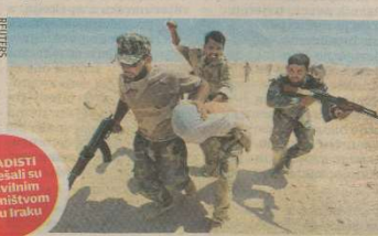
DŽIHADISTI Pomiješali su sa civilnim stanovništvom kao i u Iraku

Al-Qa'ida poručila ISIL-u: Oslobođite Alanu Henninga jer je pomagao muslimanima. Njegova je otnica korak previše Opća panika zavladała je među islamistima u provinciji Raka u Siriji nakon prelijetanja američkih bespilotnih špijunskih letjelica te se svaki trenutak očekuju američki zračni udari. Naime, iz grada Rake, oko 450 km sjeveroistočno od Damaska, u kojem živi oko 200 tisuća stanovnika, glavnom uporištu ISIL-a u Siriji, za koji se vjeruje da je mjesto odrubljivanja glava američkim novinarima te britanskom humanitarcu, prema svjedočenju tamošnjeg stanovništva boreći ISIL-a nestali su preko noći. Svi vitalni objekti u kojima su borci ISIL-a boravili jučer ujutro bili su