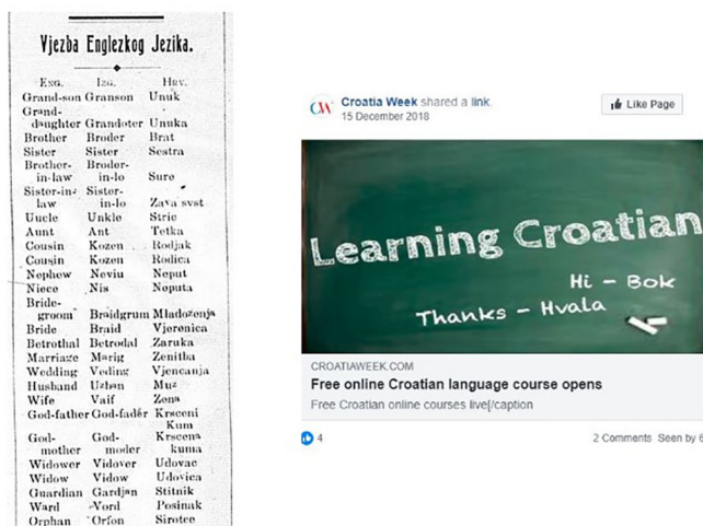
Figure 4. Example of comparing Facebook posts to the texts published in the early Croatian newspapers ( Napredak , vol. 4, no. 6 (6 February 1909); link shared on Facebook (Canterbury Croatian Society, 15 December 2018))

Napredak , vol. 4, no. 6 (February 6, 1909); link shared on Facebook (Canterbury Croatian Society, December 15, 2018)