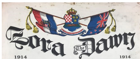
Figure 1. The title of Zora ( the Dawn ) on the title page of an issue from 1914

The United Front was published by the Slavonic Council between 23 January 1942 and 10 July 1942. A total 20 issues of The United Front are available in the Alexander Turnbull Library in Wellington. The Slavonic Council was organised by delegates appointed from