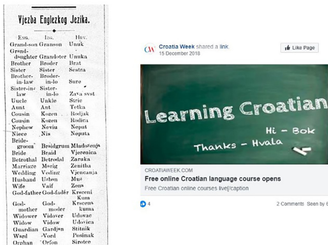
Figure 4. Example of comparing Facebook posts to the texts published in the early Croatian newspapers ( Napredak , vol. 4, no. 6 (6 February 1909); link shared on Facebook (Canterbury Croatian Society, 15 December 2018))

Napredak , vol. 4, no. 6 (February 6, 1909); link shared on Facebook (Canterbury Croatian Society, December 15, 2018)