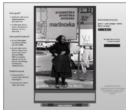
FIGURE 1. APPLICATION INTERFACE FOR GAME-BASED LABEL COLLECTING

The research was structured into three complimentary stages. In the first stage, 20 digitized photographs were thematically selected by a subject expert in charge of the collection of the photographs used in the “Croatian Homeland War” exhibition authored by the Croatian Historical Museum. After the process of selection, the subject expert added his professional descriptors to each item, following relevant standards for assigning subject metadata. The subject expert assigned a total of 117 descriptors on 20 photographs with an average number of six descriptors assigned to one item. (Table 1). After that, a game-based application was developed and used for gathering image labels on the same 20 items. The application was based on the tools developed by the Metadata Games (metadatagames.org) project, a free and open source software system that uses computer games to collect information on archival images (Figure 1).