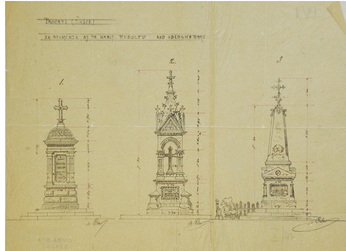
15 Martin Pilar, design for the Prince Rudolf monument near Kupinovo, 1889. Archiepiscopal Archive, Zagreb, Collection of Architectural Designs, sign. II-47

The Petrovaradin Property Management Authority opted for the third version. As the monument was destroyed during the Second World War, we have to rely for information about its appearance, apart from what the preserved design drawings offer, on the illustration of the monument made by the famous Croatian painter Celestin Medović for the volume of Die Österreichisch-ungarische Monarchie in Wort und Bild dedicated to Croatia. 74