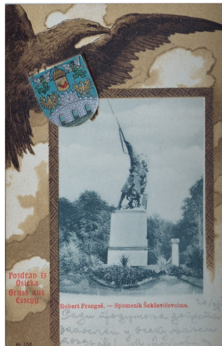
3 Robert Frangeš Mihanović, Monument to the Heroes of the 78th Home Guard Osijek Regiment , so-called Šokčević's Monument , Osijek, 1897–1898, postcard, early 20th century. Museum of the Serbian Orthodox Church in Belgrade, Radoslav Grujić Estate

the figure of a warrior dressed in the uniform of said regiment, which fought on the battlefields of Bohemia in the Austro-Prussian War in 1866.