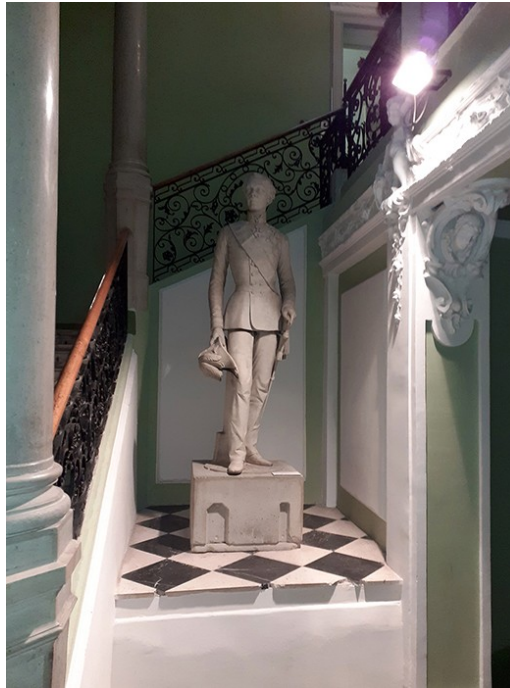
12 Pietro Stefanutti, Statue of Franz Joseph I from the Rijeka memorial fountain, 1857. State Archives in Rijeka

[38] At the time this monument was built, Rijeka was under the administration of Croatia proper. With the 1868 Croatian-Hungarian Settlement, the city became a Corpus separatum , separate from the Croatian territory and directly subordinate to Hungary. It seems likely that it was these political changes that led to the removal of the memorial fountain. As early as 1874, the city government decided to relocate the fountain justifying the decision in terms of easing the flow of traffic, but neither the fountain nor the statue of the emperor was ever re-erected at a different location. The reason for removing the fountain was probably the Austrian imperial coat of arms that stood on it, which for many was a symbol of the centralist and absolutist policies of Alexander von Bach who headed the government at the time. The removal can thus be interpreted as a sign of a strong anti-Viennese sentiment in the city, fuelled by Hungarian nationalism. This act, however, ensured the preservation of the monument, which has been given a place on the staircase of the Rijeka State Archives. 57