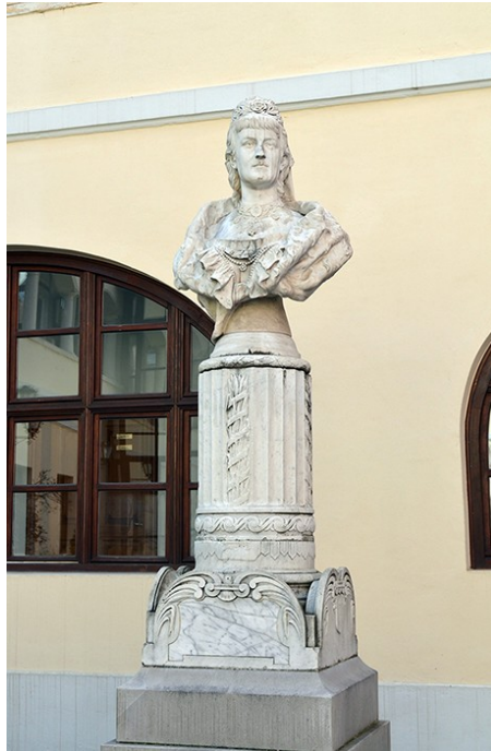
11 Ivan Rendić, Monument to Empress Elisabeth , Varaždin, 1898–1900

Its design was entrusted to Rendić, who made the first sketches for it in 1898 and completed it in 1899–1900. 49 After the dissolution of the Monarchy, the monument was damaged and removed, but not destroyed. It was first moved to the Varaždin theatre and then to the City Museum, and was later re-erected in the courtyard of the Varaždin County building, where it stands today. In addition to the memorial in Donji Miholjac, which will be discussed below, the Varaždin memorial represents a rare example of a monument to the Habsburgs in Croatia that underwent restoration (although in this case the monument was not reinstalled in its original location). 50