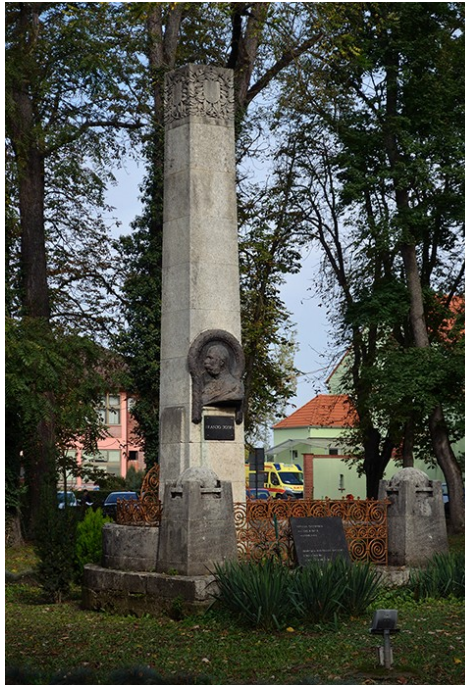
14 Robert Frangeš Mihanović, Monument to Franz Joseph I in Donji Miholjac, 1905

Vrapče near Zagreb, bearing a portrait of the emperor executed in bronze. 64 It was topped by a coat of arms, most likely of the Triune Kingdom or Virovitica County, which was later removed. The monument is surrounded by a fence and four pillars whose form evokes those on the Secession building in Vienna (Fig. 14).