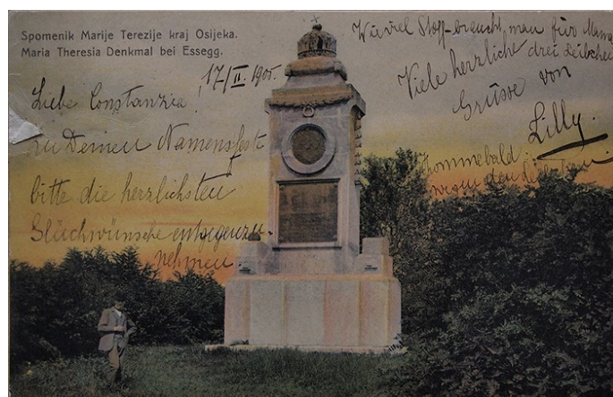
5 Monument to Maria Theresia and Joseph II, erected in Osijek in 1779, postcard. State Archives in Osijek, collection of postcards