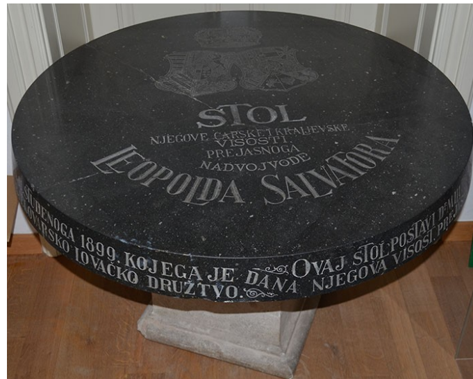
16 Memorial table built in 1903 in the Jasik Forest near Bjelovar, commemorating the pheasant hunt of Archduke Leopold Salvator in this forest in 1899. Bjelovar City Museum, Cultural-Historical Department, Collection of Furnishing, Inv.-Nr 1608