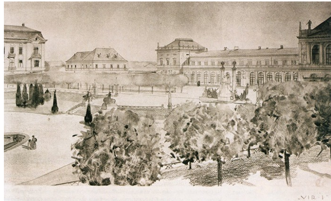
9 Viktor Kovačić, (unexecuted) design for Franz Joseph I Square in Zagreb with a monument dedicated to the emperor, 1904–1905. Ministry of Culture of the Republic of Croatia, Zagreb, Collection of Architectural Designs

Railway Station, and on the north by the Art Pavilion. After years of planning the layout of the square, the city government finally launched an architectural design competition in 1905. The competition was won by the Zagreb architect Viktor Kovačić (1874–1924), a student of Otto Wagner, who, in addition to the proposed urban development of the square and the construction of a flight of steps on the square, also envisaged a monument to the emperor, to be erected on the south side, facing the Main Railway Station. While the sketches for the monument have been preserved (Fig. 9), a description has not survived, so its iconographic program is unknown.