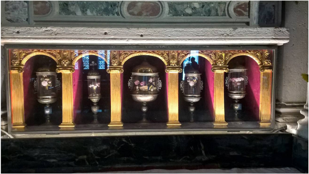
Fig. 3. Reliquary-predella of the altar in the lower hall of the Scuola