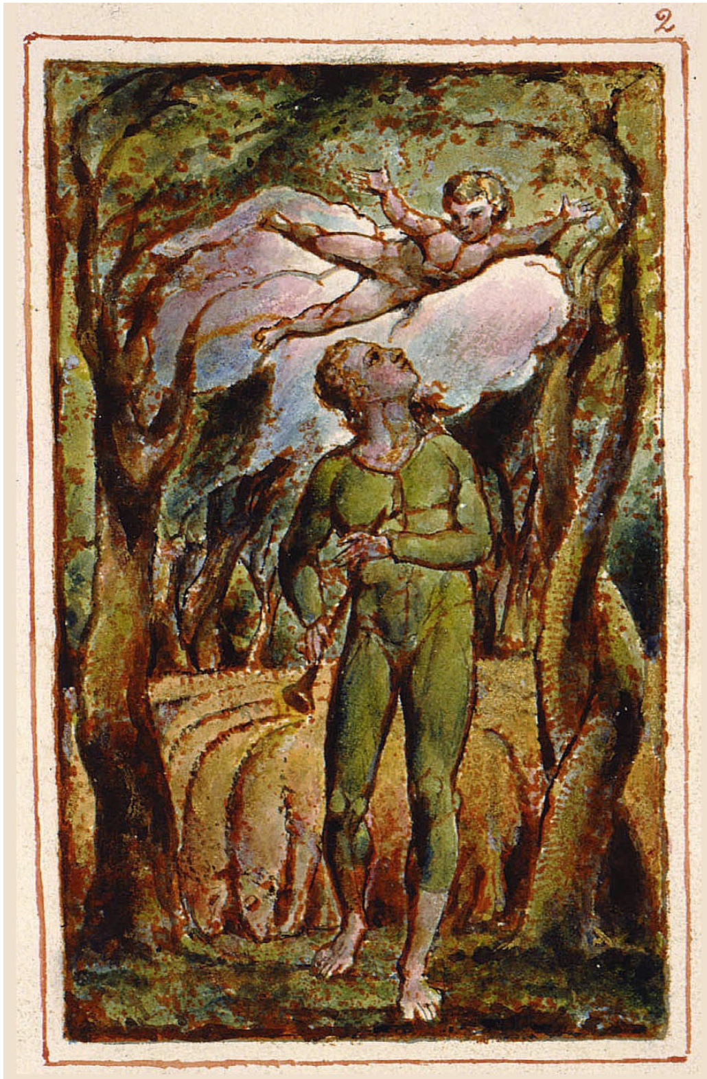
Fig. 3: Frontispiece to Songs of Innocence: Blake, William, Object 2, The William Blake Archive, 11.0 x 7.0 cm