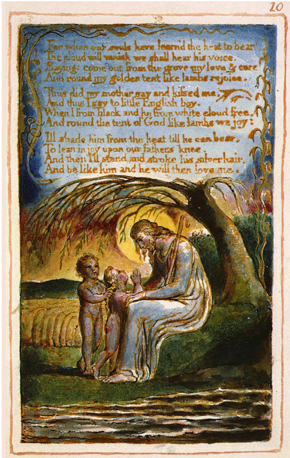
Fig. 15: 'The Little Black Boy': Blake, William, Object 10, The William Blake Archive, 11.1