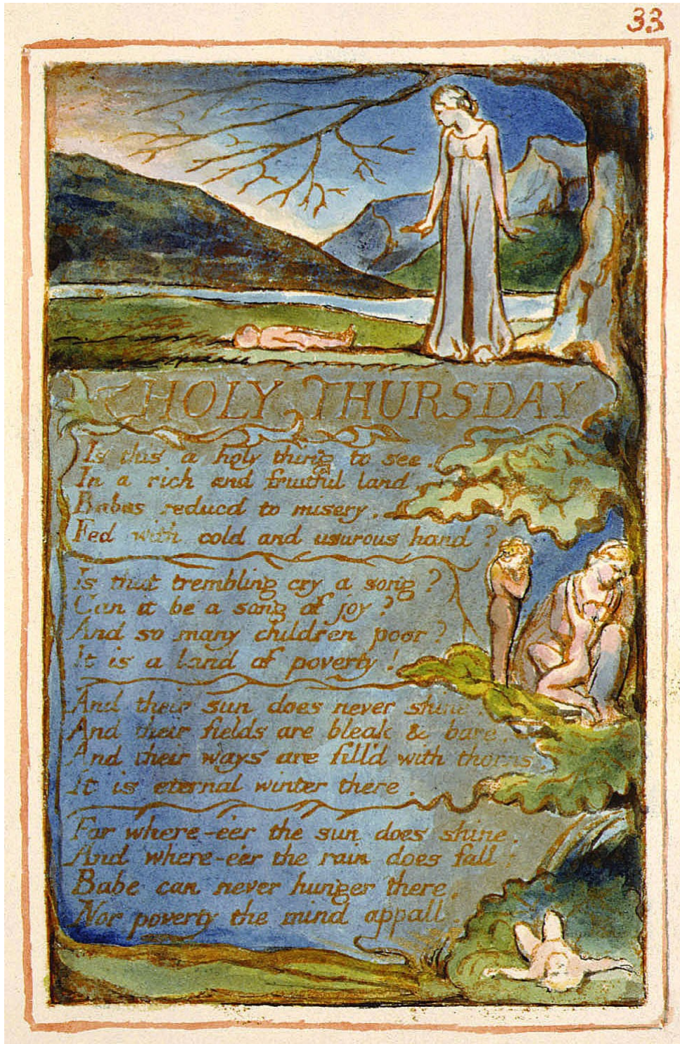
Fig. 12: 'Holy Thursday': Blake, William, Object 33, The William Blake Archive, 11.3 x 7.3