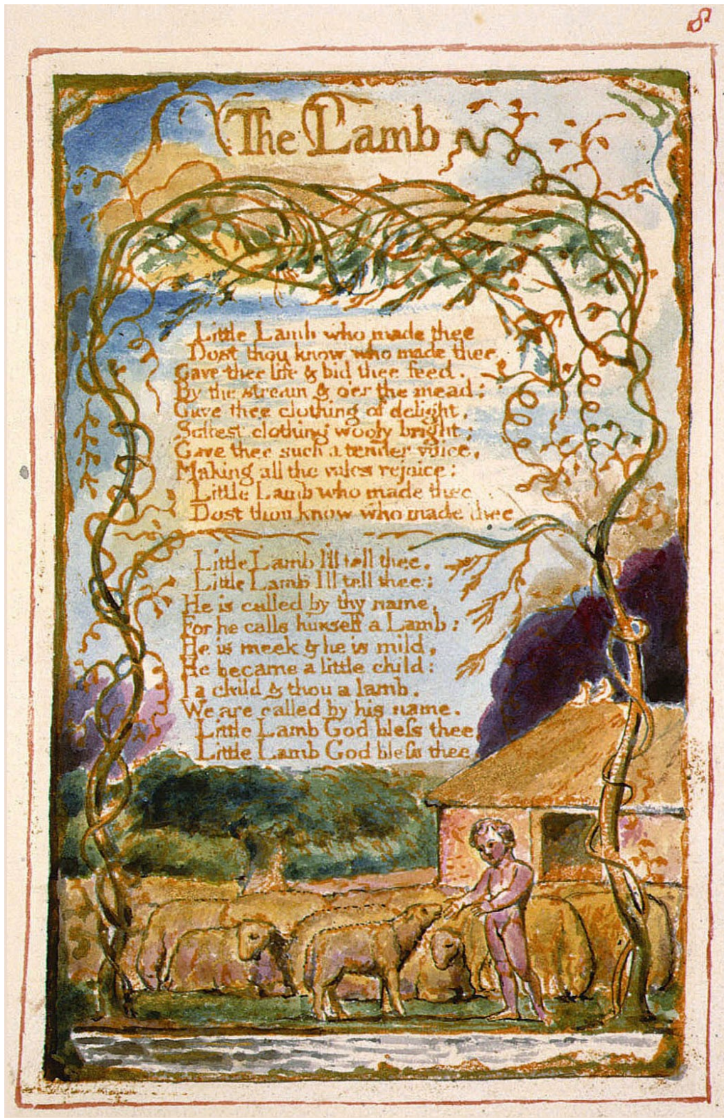
Fig. 6: 'The Lamb': Blake, William, Object 8, The William Blake Archive, 11.9 x 7.7 cm