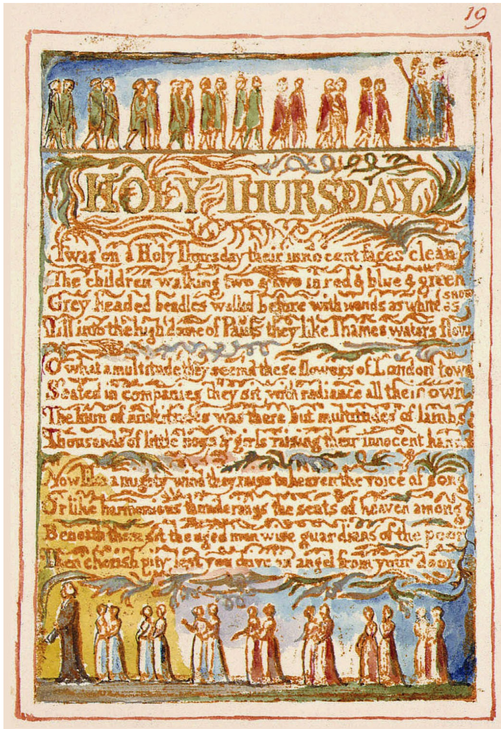
Fig. 11: 'Holy Thursday': Blake, William, Object 19, The William Blake Archive, 11.4 x 7.7