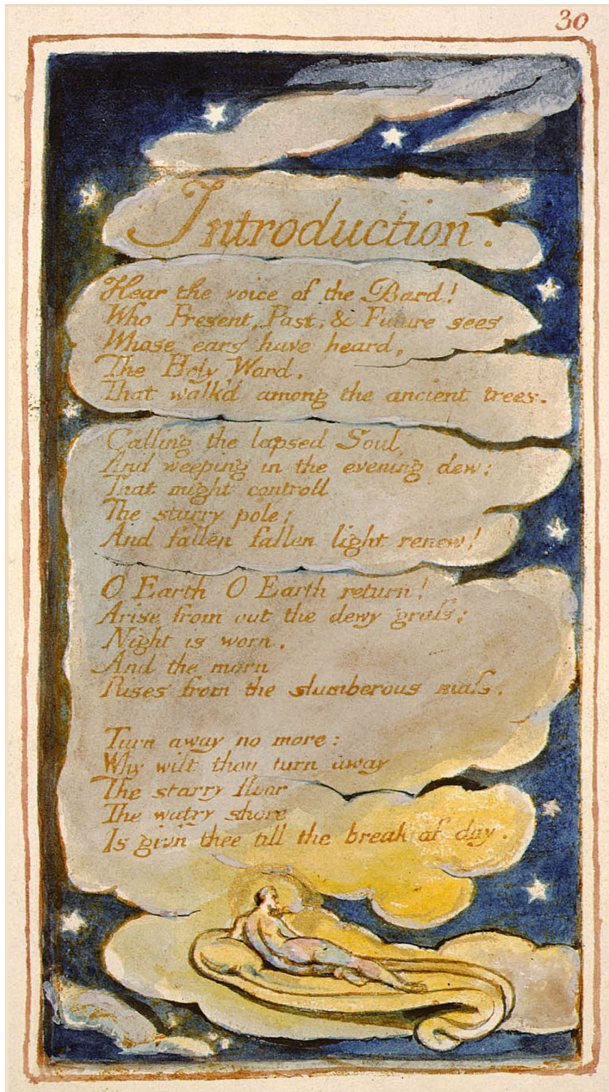
Fig. 4: 'Introduction': Blake, William, Object 30, The William Blake Archive, 12.4 x 7.2 cm