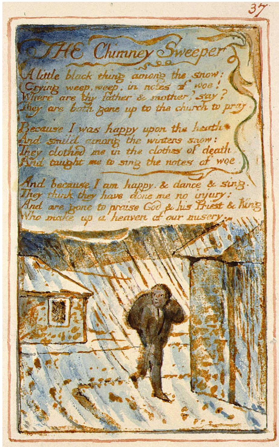
Fig. 9: 'The Chimney Sweeper': Blake, William, Object 37, The William Blake Archive, 11.0