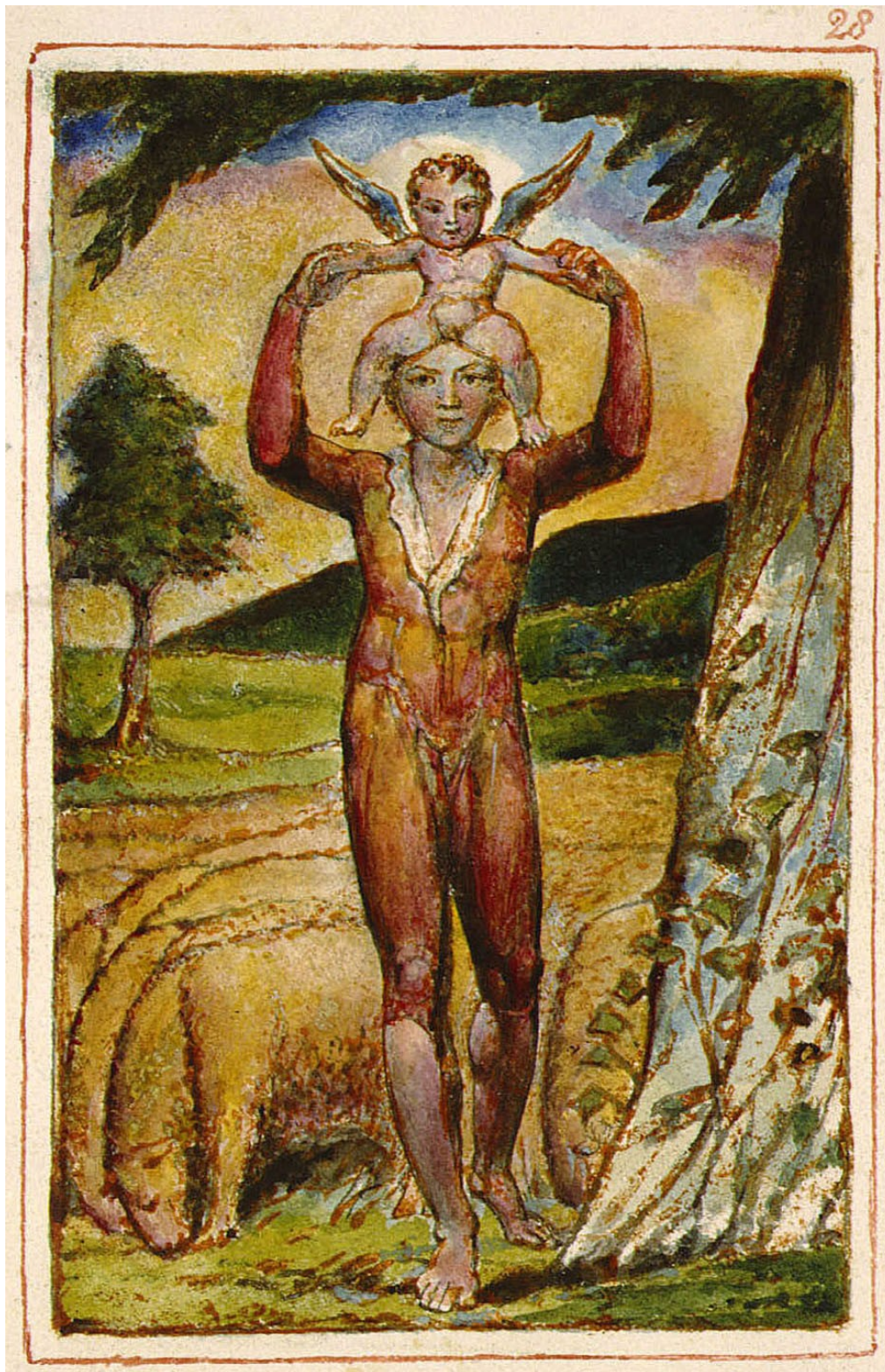
Fig. 5: Frontispiece to Songs of Experience: Blake, William, Object 28, The William Blake Archive, 11.0 x 7.0 cm