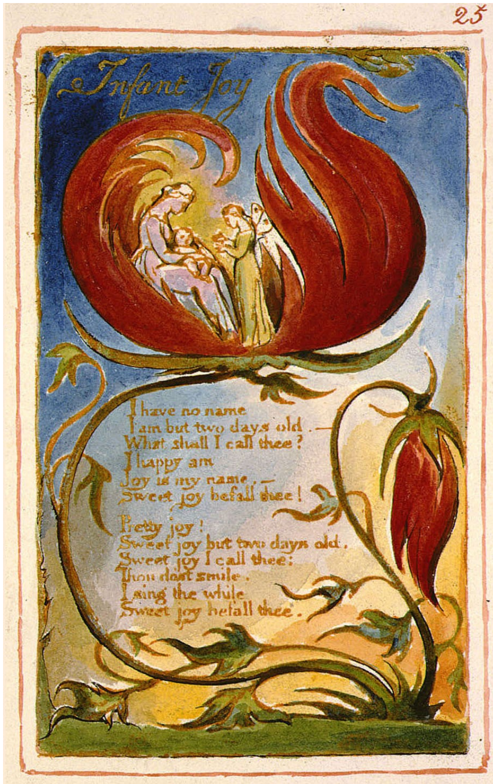
Fig. 7: 'Infant Joy': Blake, William, Object 25, The William Blake Archive, 11.1 x 6.8 cm