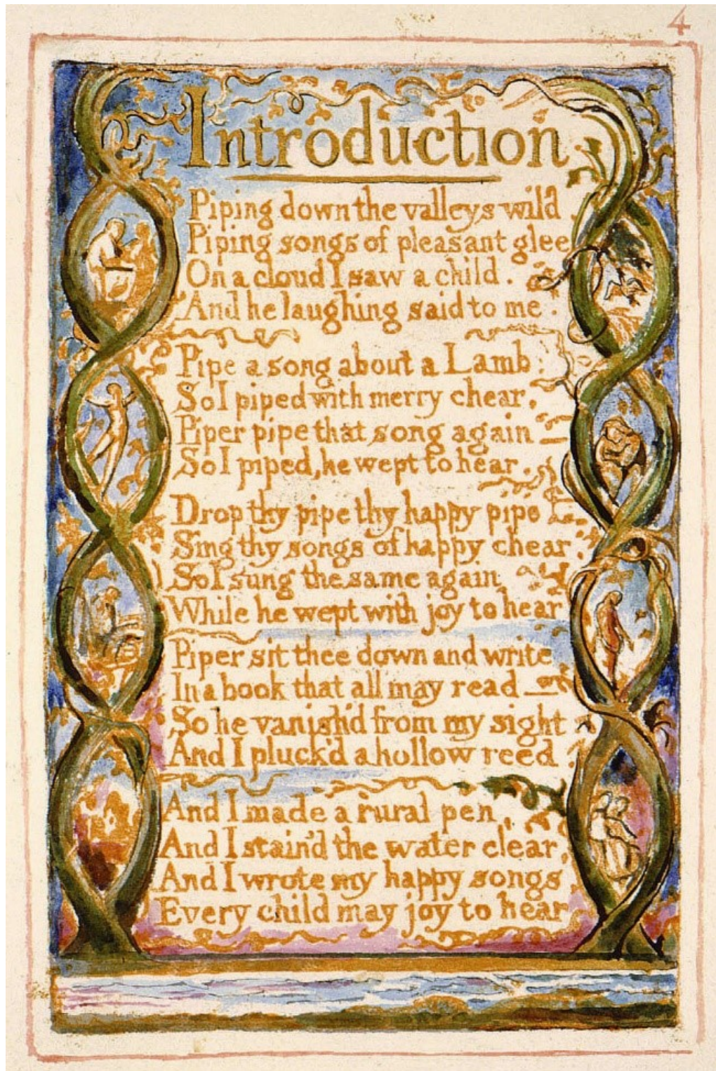
Fig. 2: 'Introduction': Blake, William, Object 4, The William Blake Archive, 11.3 x 7.9 cm