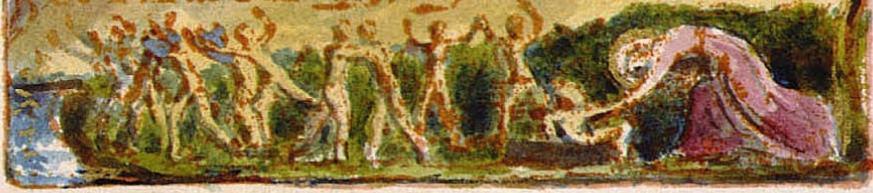
Fig. 8: 'The Chimney Sweeper': Blake, William, Object 12, The William Blake Archive, 12.2

When my mother died I was very young, And my father sold me while yet my tongue Could scarcely cry weep weep weep weep, So your chimneys I sweep & in soot I sleep. There's little Tom Dacre who cried when his head That curl'd like a lamb's back, was shav'd, so I said, "Push Tom never mind it, for when your heads bare You know that the soot cannot spoil your white hair." And so he was quiet & that very night, As Tom was a sleeping he had such a sight, That thousands of sweepers Dick, Joe Ned & Jack Were all of them lock'd up in coffins of black, And by came an Angel who had a bright key, And he open'd the coffins & set them all free: Then down a green plain leaping laughing they run, And wash in a river and shine in the Sun. Then naked & white, all their bags left behind, They rise upon clouds, and sport in the wind, And the Angel told Tom, if he'd be a good boy, But have God for his father & never want joy And so Tom awoke, and we rose in the dark And got with our bags & our brushes to work Tho' the morning was cold, Tom was happy & warm, So if all do their duty, they need not fear harm.