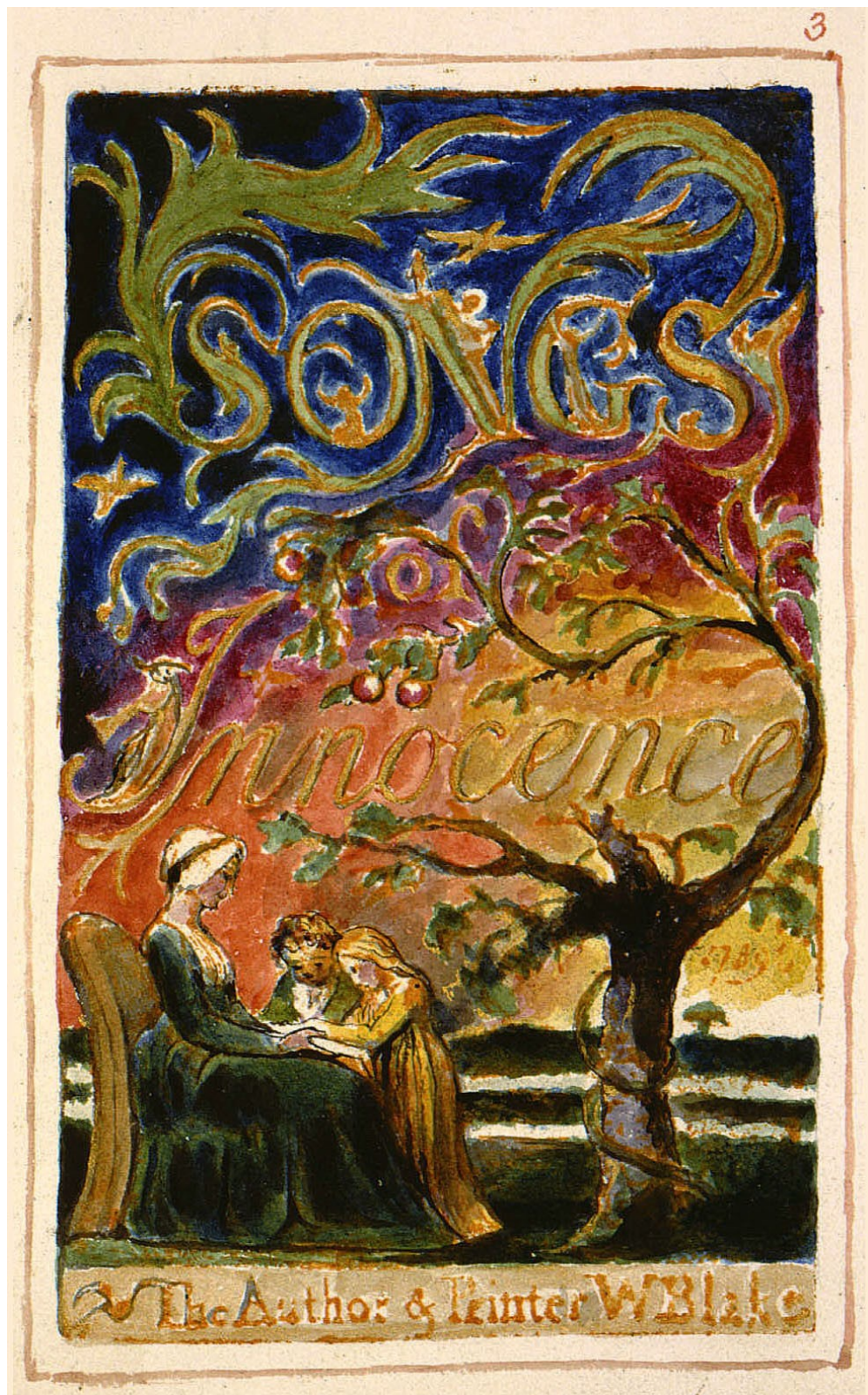
Fig. 1: Title page: Blake, William, Object 3, The William Blake Archive, 12.0 x 7.4 cm