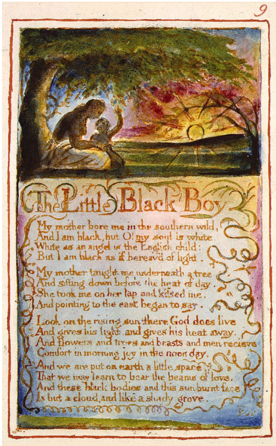
Fig. 14: 'The Little Black Boy': Blake, William, Object 9, The William Blake Archive, 11.1 x 6.9 cm