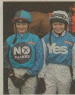
Novinarka Jutarnjeg u Edinburghu (lijevo). Članovi tiste obitelji (gore) ne mogu se usuglasiti oko odgovora