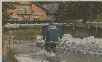
Šest mjeseci nakon katastrofalnih poplava, Hrvatska opet pod vodom

Probleme također očekujemo i u mjestu Sveti Đurad kod Donjeg Miholjca, gdje je potencijalno ugroženo šest kuća u najnižem dijelu naselja - rekao je Haničar, dodavši