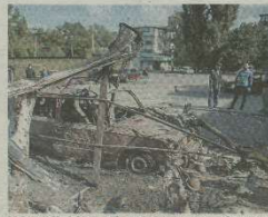
U Ukrajini je poginulo 30 osoba otkad je primirje na snazi od ministra obrane punu borbenu spremnost», rekao je Jaccenjuk. Mirovni plan predsjednika Petra Porošenkina ne znači «opuštanje u radu ministarstava obrane i unutarnjih poslova, potrebna je puna spremnost». «Ne možemo nikome vjerovati, a najmanje Rusima», naglasio je Jaccenjuk. (Hina/AFP)

DONJECK ■ Dva civila ubijena su u pucnjavi u Donjecku, proruskom ustaničkom uporištu na istoku Ukrajine, objavilo se u srijedu lokalne vlasti, dok je premijer Arsenij Jaccenjuk pozvao vojsku na punu borbenu spremnost. «Dvije civilne osobe ubijene su, a tri ranjene», objavila je gradska uprava, dan nakon što su ukrajinski zastupnici usvojili nacrt zakona koji daje više autonomije proruskim separatističkim područjima u okviru mirovnog protokola što su ga potpisali Kijev i separatisti. Zračna luka u Donjecku već je nekoliko dana poprište izmjene vatre. Vojska koja kontrolira infrastrukturu optužuje pobunjenike da pucaju na njezine položaje. Po brojkama agencije France presse, ukupno je do sada, otkad je na snagu stupio prekid vatre 5. rujna, poginulo 30 osoba, 14 civila i 16 vojnika. Vojska i pobunjenici međusobno prebacuju odgovornost za žrtve. Jaccenjuk je od ministarstva obrane zatražio da osigura da snage budu u punoj borbeno spremnosti, bez obzira na prekid vatre. «Rusija nam neće dati miru, zato tražim