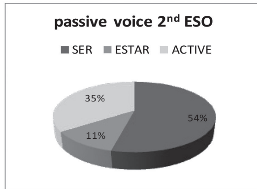
Figure 2. Passive voice formation (2 nd ESO)

In sentence 2 the students had to choose the most acceptable way to express marital status. Spanish grammar books usually state that the use of ser and estar in expressing marital status is interchangeable, yet few people would ever say ser casado 'to be married' in everyday conversation. Soy casado refers to the quality of being married, and it would be translated as 'I am a married man', while estar casado emphasizes the current state of being married. Hence, it is correct to use both constructions but most Spanish people use estar with adjectives casado/a 'married', divorciado/a 'divorced', and soltero/a 'single', and ser with viuda/o