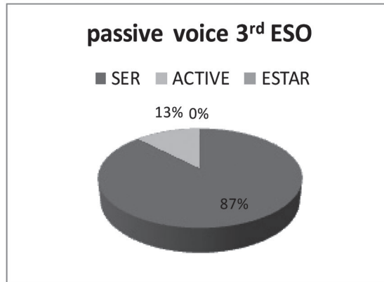
Figure 1. Passive voice formation (3 rd ESO)

the passive voice with ser or estar and a sentence in the active voice. As Figure 1 shows, in the 3 rd ESO 14 students (87%) chose the passive form with ser , and two (13%) of them chose the active sentence. Nobody chose a passive sentence with estar . Figure 2 shows the results of the 2 nd ESO. In that class 14 students (54%) chose a passive sentence with ser , three (11%) of them chose a passive sentence with estar and nine (35%) of them opted for an active sentence.