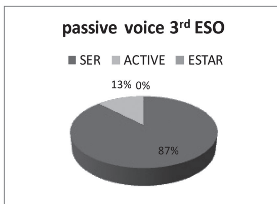
Figure 1. Passive voice formation (3 rd ESO)

the passive voice with ser or estar and a sentence in the active voice. As Figure 1 shows, in the 3 rd ESO 14 students (87%) chose the passive form with ser , and two (13%) of them chose the active sentence. Nobody chose a passive sentence with estar . Figure 2 shows the results of the 2 nd ESO. In that class 14 students (54%) chose a passive sentence with ser , three (11%) of them chose a passive sentence with estar and nine (35%) of them opted for an active sentence.