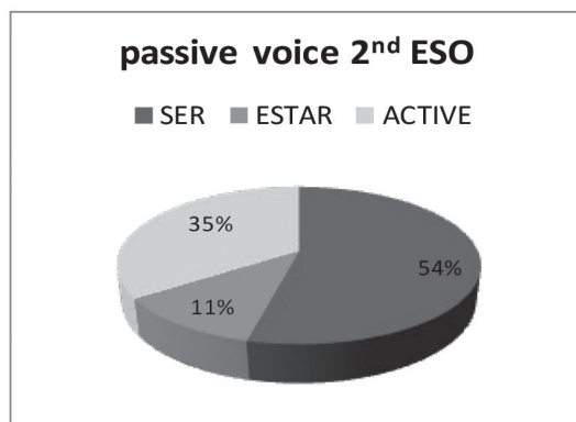
Figure 2. Passive voice formation (2 nd ESO)

In sentence 2 the students had to choose the most acceptable way to express marital status. Spanish grammar books usually state that the use of ser and estar in expressing marital status is interchangeable, yet few people would ever say ser casado 'to be married' in everyday conversation. Soy casado refers to the quality of being married, and it would be translated as 'I am a married man', while estar casado emphasizes the current state of being married. Hence, it is correct to use both constructions but most Spanish people use estar with adjectives casado/a 'married', divorciado/a 'divorced', and soltero/a 'single', and ser with viuda/o