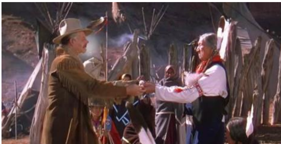
Figure 2. Captain Nathan Brittle's and chief Pony that Walks

Unlike former Native American stereotypes, the leader of the Arapaho tribe, an elderly chief named Pony that Walks is shown as captain Brittle's old friend.