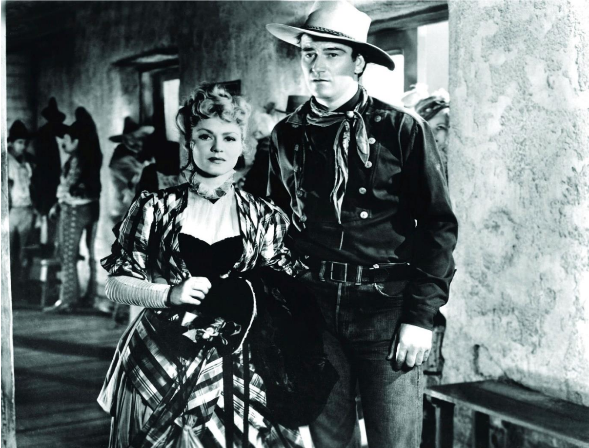
Figure 1. Dallas and Ringo

the embodiment of a second chance, something young people in 1939 longed for due to the harsh economical situation that The Great Depression has put them through. Her character was proof that no matter the hardship somebody goes through, there is always hope for a happy ending, one she had after escaping to Mexico with Ringo.