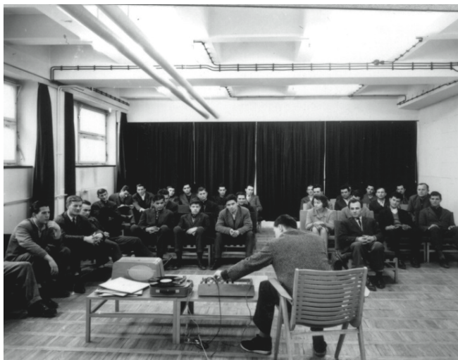
Figure 10. Interior of Moša Pijade Workers' University in Zagreb (1961), music education.