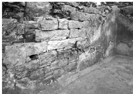
Fig. 1b. Detail of the northern corner showing drywall blocks as well as the multi-layered waterproof mortar