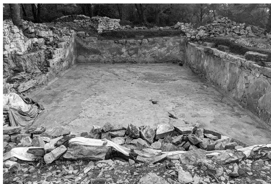
Fig. 1a. The cistern at the end of the excavations

The Center for Prehistoric Research has excavated different sites in Lumbarda since 2007. In that period we did extensive analysis of all existing published texts as well as unpublished documentation and testimonies of living participants of events related to the discovery of different fragments of “The Psephisma of Lumbarda”. Our conclusion was that all fragments were in some way connected to an archaeological site on the Koludrt peninsula in Lumbarda, although circumstances of individual discoveries were not always clear. The site itself was primarily thought to be ruins of the monastery of St. John (Brunšmid 1898), but already Frane Kršinić Šove, who discovered fragments K, L, M and N, and D. Rendić-Miočević in his publication suggested that it was actually a water cistern from the “pre-Roman period” (Rendić-Miočević 1970, 32). In later literature this structure was rarely and briefly mentioned and sometimes incorrectly dated into Roman times (Fazinić ed. 2007, 115). During the annual field survey in 2017, we recorded increasing structural damage on the walls of the cistern and initiated a rescue excavation as the object itself was in danger of collapsing. Three years of excavation established that the cistern was built of large stone blocks in a drywall technique and plastered by three very fine layers of waterproof mortar. The monumental size of the cistern (approximately 10m × 17m), with depth of 3.5m at the deepest point of the inclined bottom, make it quite unique.