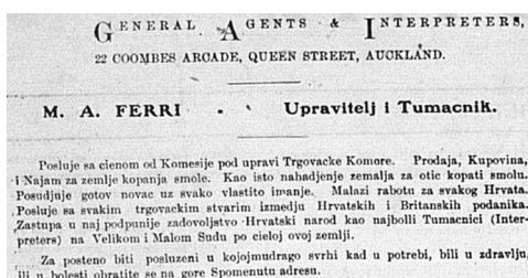
Figure 2. Advertisement in Napredak (1899) for M. Ferri's agency

In the second half of the twentieth century and at the beginning of the twenty-first century, Croats did not have problems with the English language, so their information needs could be satisfied through information published in English. According to the 2014 census, there were 2,637 Croats in New Zealand (0.06 per cent of the New Zealand population). Geographically, 68 per cent of them live in the Auckland region, 8.8 per cent in the Northland region and 8 per cent in the Wellington region. Half of the Croatian population in New Zealand speak more than one language (the percentage for the whole New Zealand population who speak more than one language is 20 per cent). Significantly, a 75 per cent of Croatian children (under the age of 15) speak only one language – presumably, English.