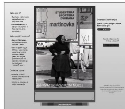
FIGURE 1. APPLICATION INTERFACE FOR GAME-BASED LABEL COLLECTING

The research was structured into three complimentary stages. In the first stage, 20 digitized photographs were thematically selected by a subject expert in charge of the collection of the photographs used in the “Croatian Homeland War” exhibition authored by the Croatian Historical Museum. After the process of selection, the subject expert added his professional descriptors to each item, following relevant standards for assigning subject metadata. The subject expert assigned a total of 117 descriptors on 20 photographs with an average number of six descriptors assigned to one item. (Table 1). After that, a game-based application was developed and used for gathering image labels on the same 20 items. The application was based on the tools developed by the Metadata Games (metadatagames.org) project, a free and open source software system that uses computer games to collect information on archival images (Figure 1).