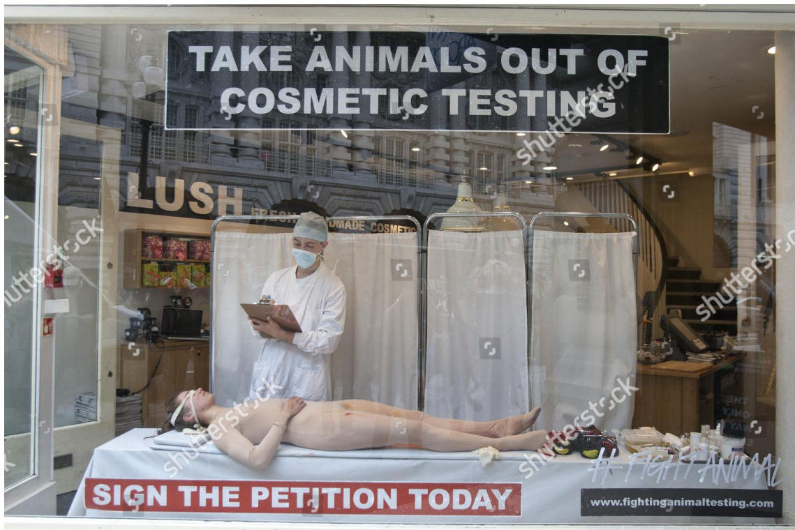
Figure 6.