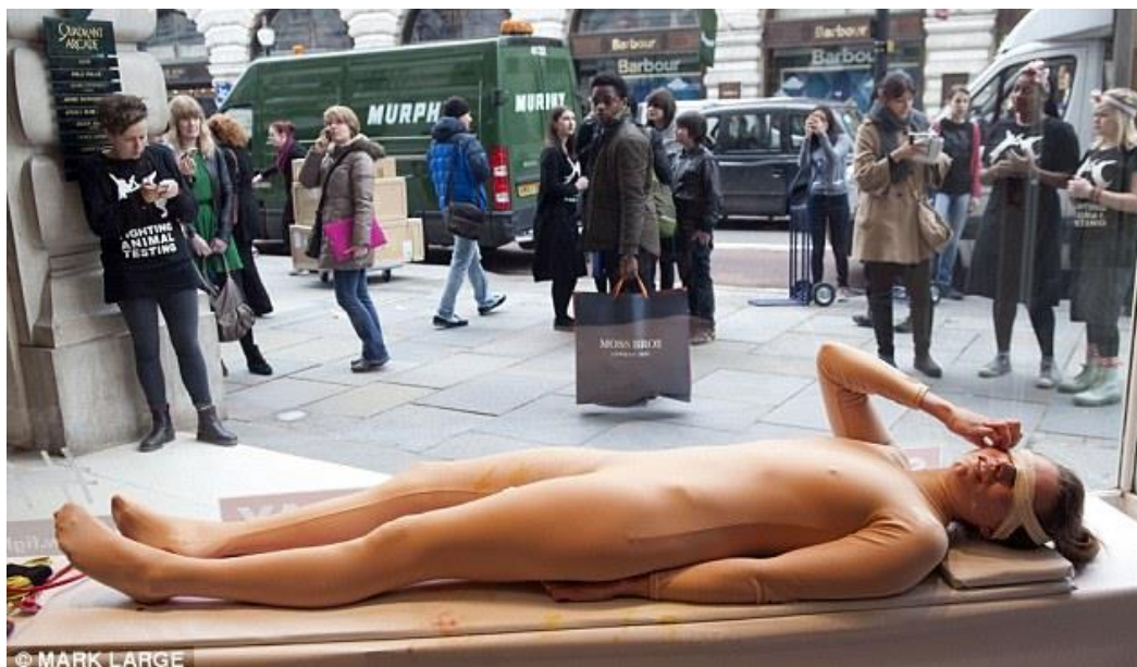
Figure 7.