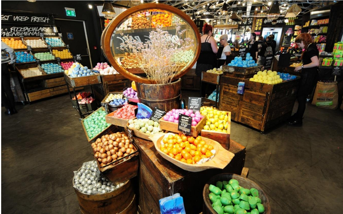
Figure 19.