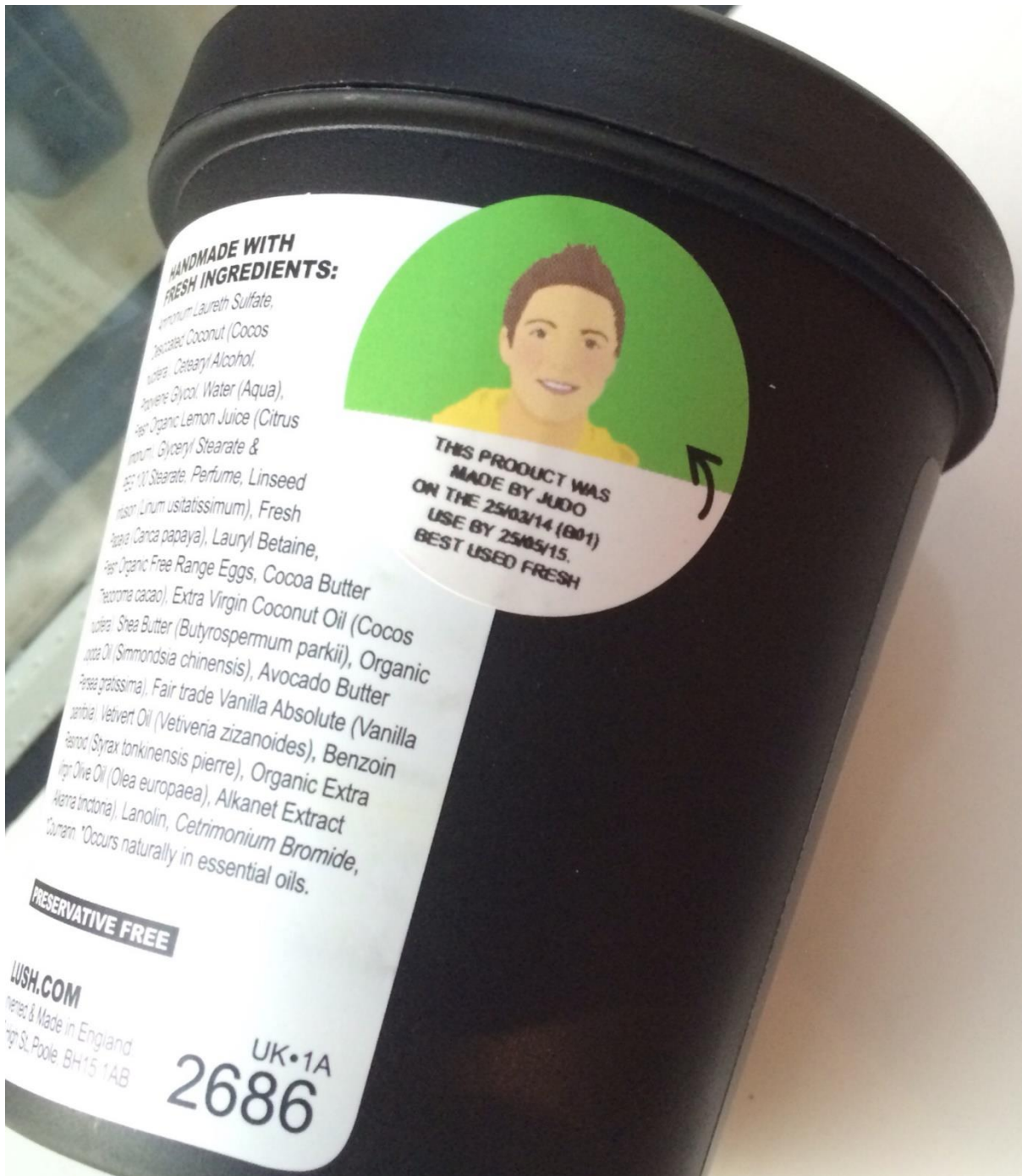
Figure 25. ( http://theblushdiaries.com/wp-content/uploads/2014/07/photo-2-1.jpg )