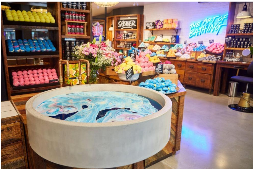
Figure 16. ( https://www.urbanyvr.com/lush-robson-street-grand-opening/ )