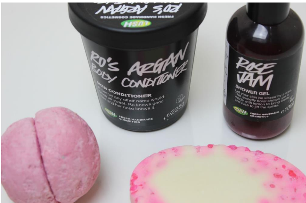
Figure 27.