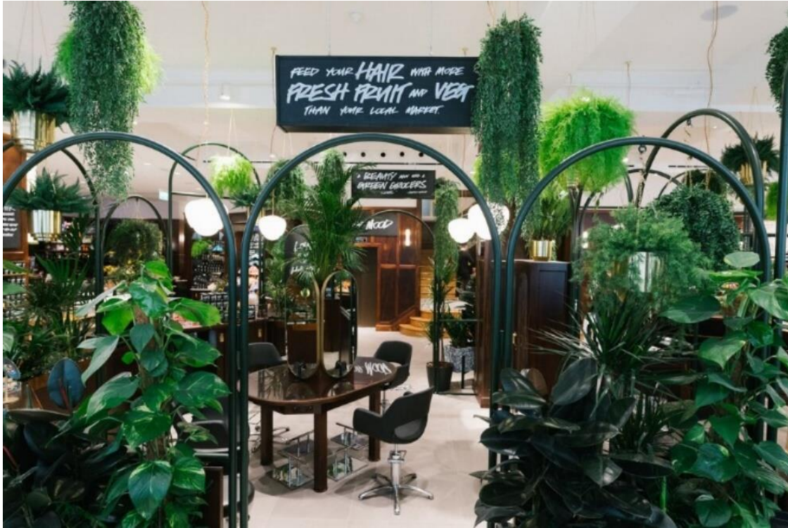
Figure 1. ( https://www.278create.com/work-lush )