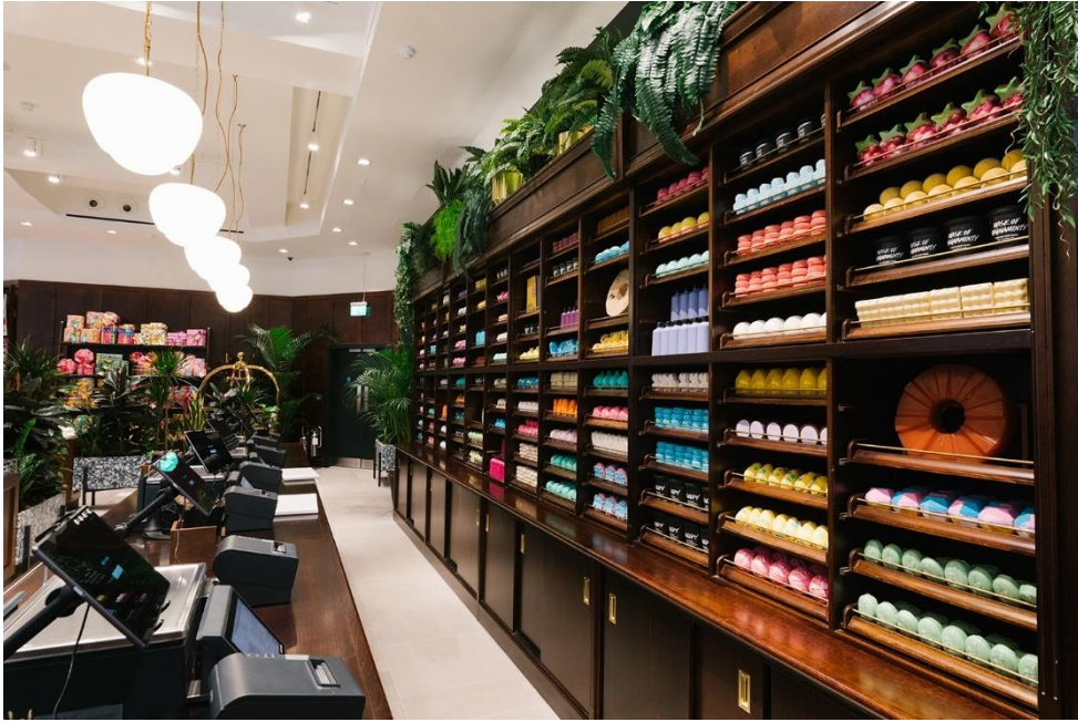
Figure 15. ( https://www.bdcmagazine.com/2019/06/portview-completes-fit-out-of-worlds-biggest-lush-store/ )