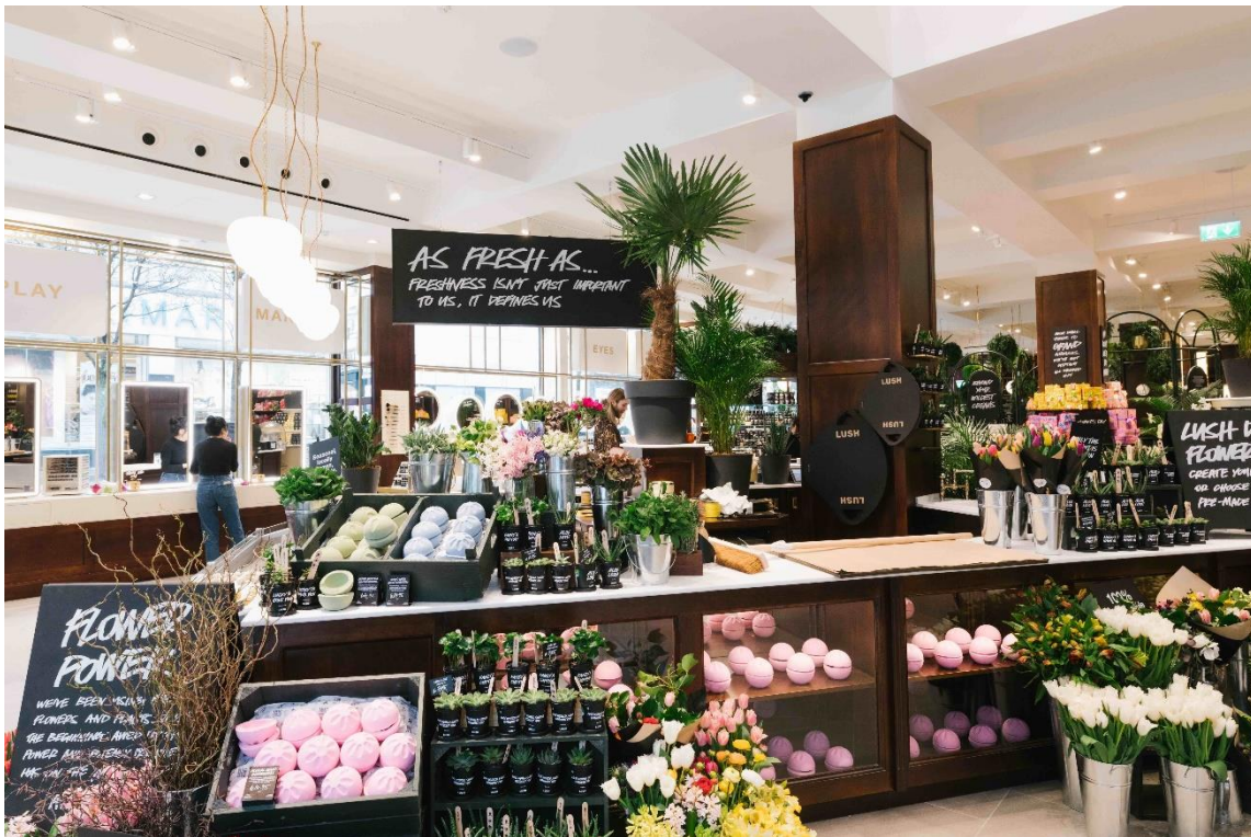
Figure 2. ( https://www.vxdeal.com/?product_id=89156401_38 )