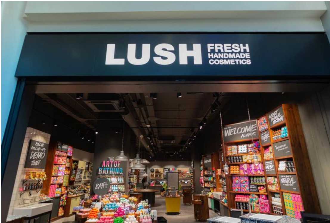
Figure 17. ( https://weare.lush.com/press-area/ )