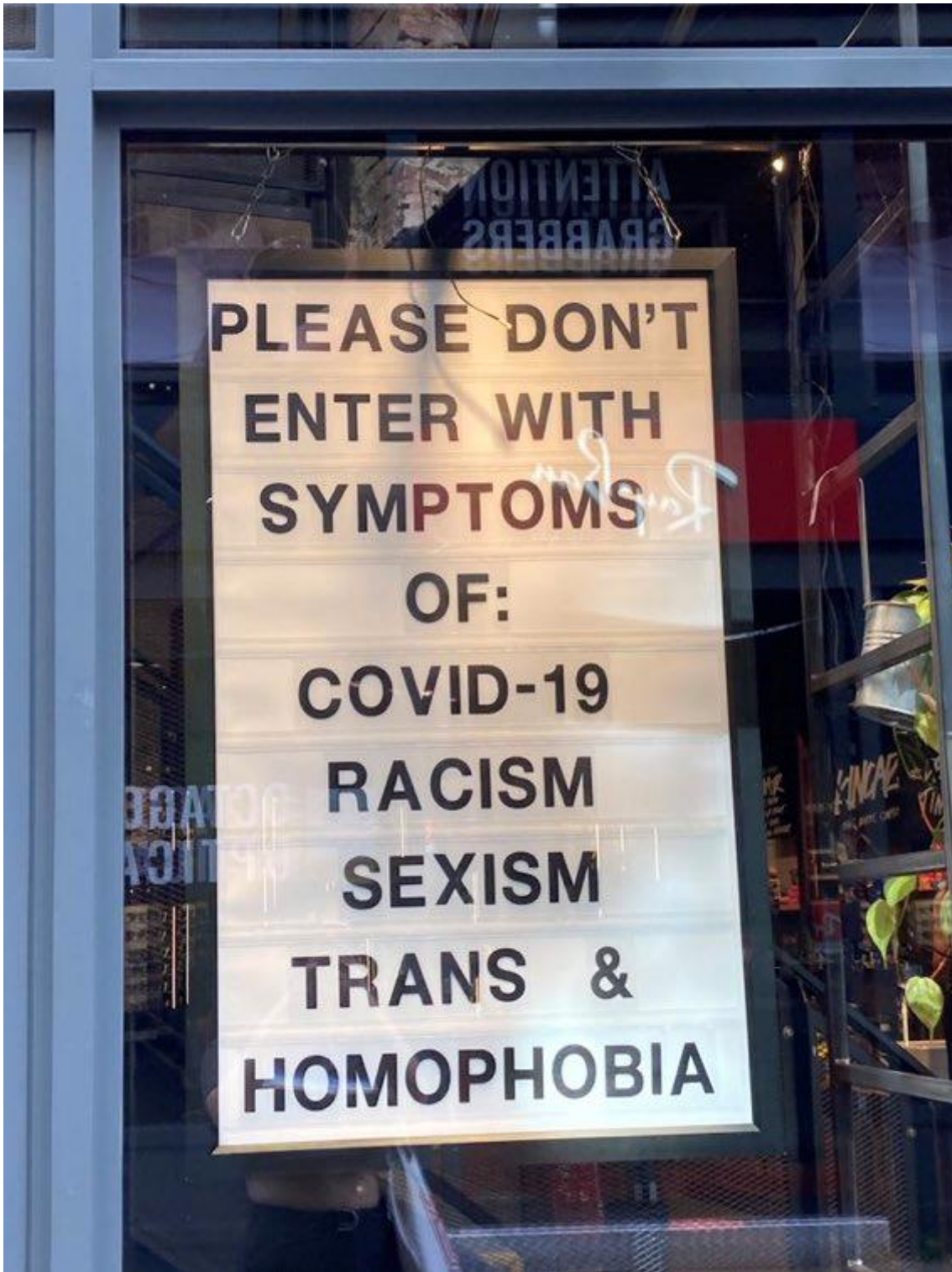
Figure 10. ( https://flipboard.com/article/please-don-t-enter-with-symptoms-of-covid-19-racism-sexism-trans-amp-homoph/a-kZsSnKZIR9-wNYxdrOgRPA%3Aa%3A33509979-%2F0 )