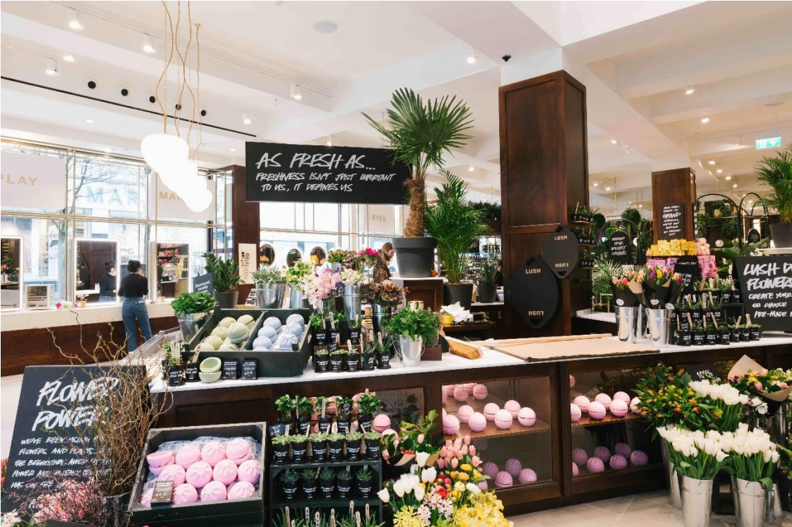
Figure 2. ( https://www.vxdeal.com/?product_id=89156401_38 )