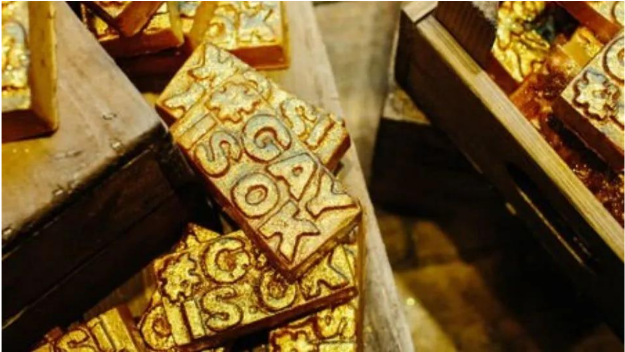
Figure 11. ( https://stylecaster.com/beauty/lush-cosmetics-gay-ok-soap/ )