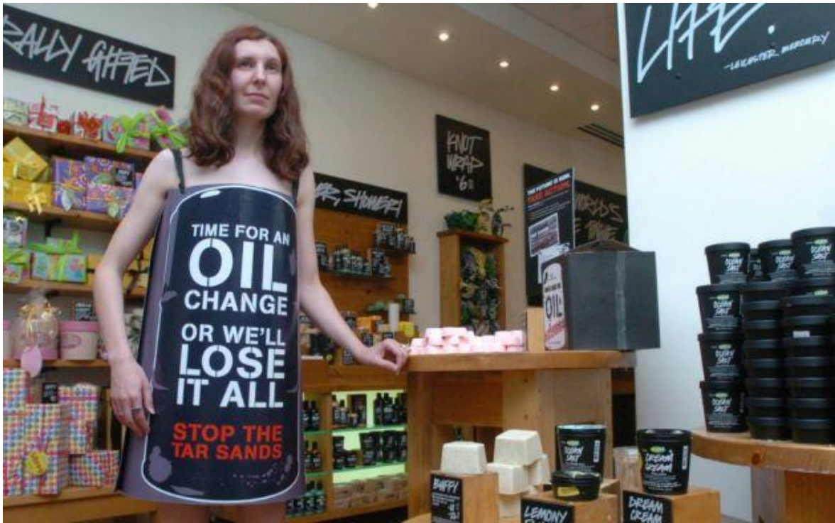
Figure 13. ( https://veganfeministnetwork.com/lush/ )