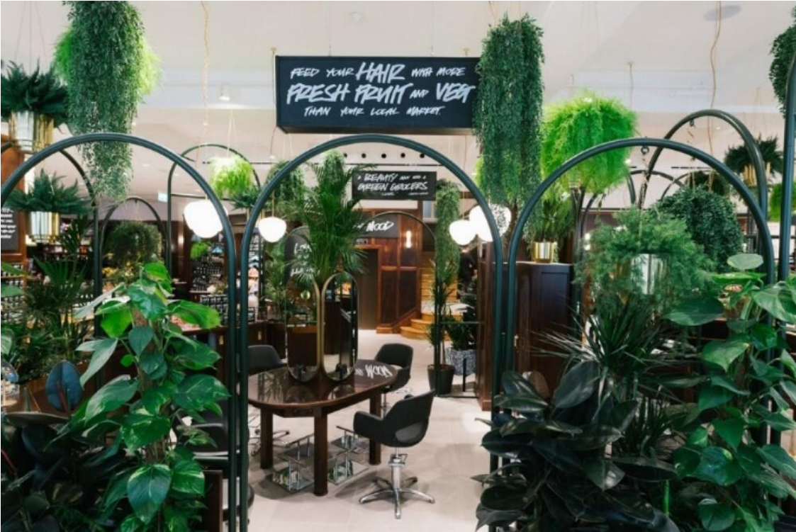
Figure 1. ( https://www.278create.com/work-lush )