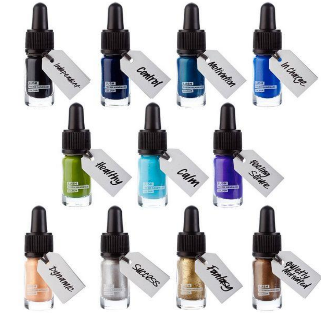
Figure 28. ( https://thenotice.net/2012/07/lush-emotional-brilliance-range/ )