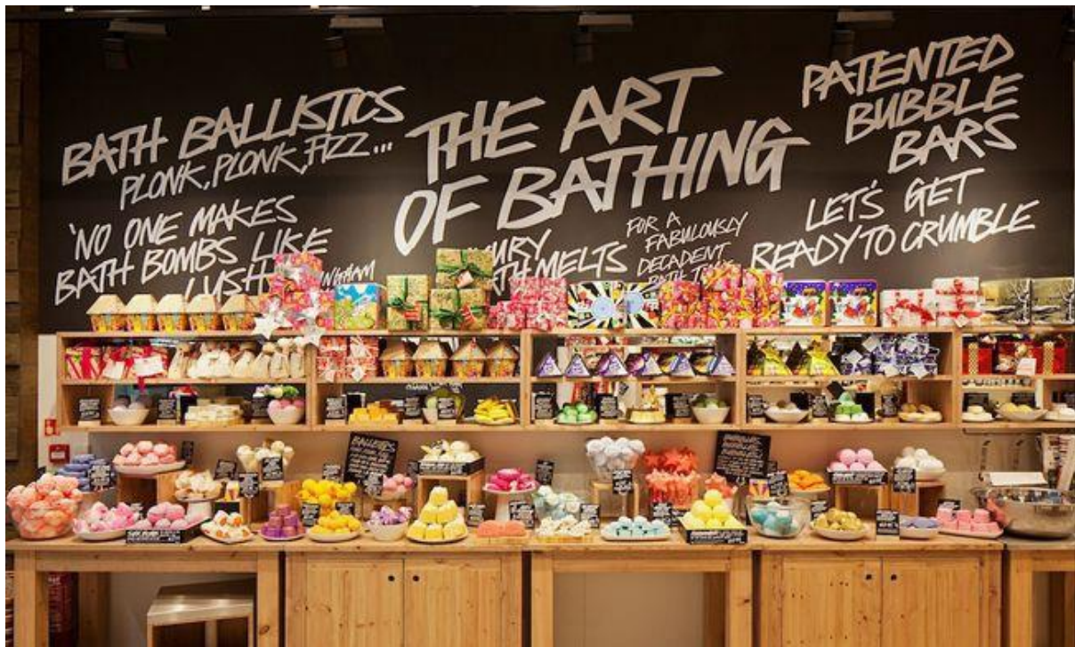
Figure 23. ( https://latana.com/post/lush-deep-dive/ )