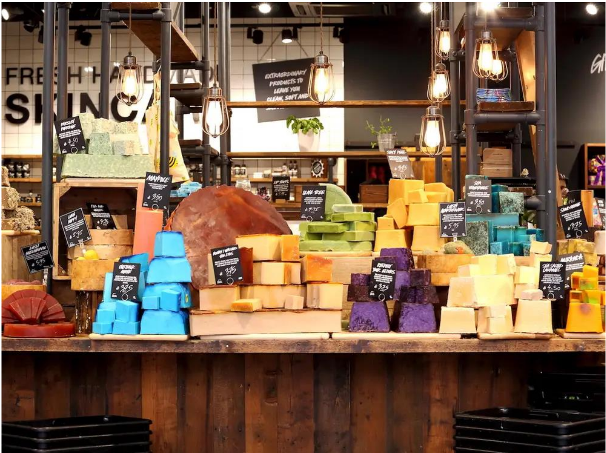
Figures 8 and 9. ( https://www.businessinsider.com/lush-naked-no-packaging-store-uk-2019-1 )