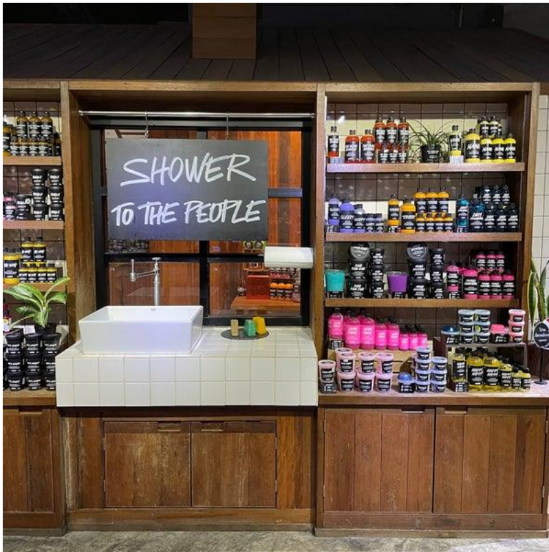
Figure 21. ( https://foursquare.com/v/lush/5853f5a3da54ae2d25e9bc1f/photos )