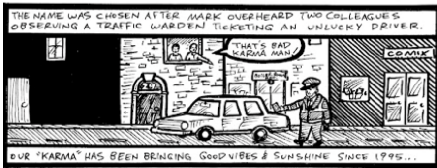
Figure 4.