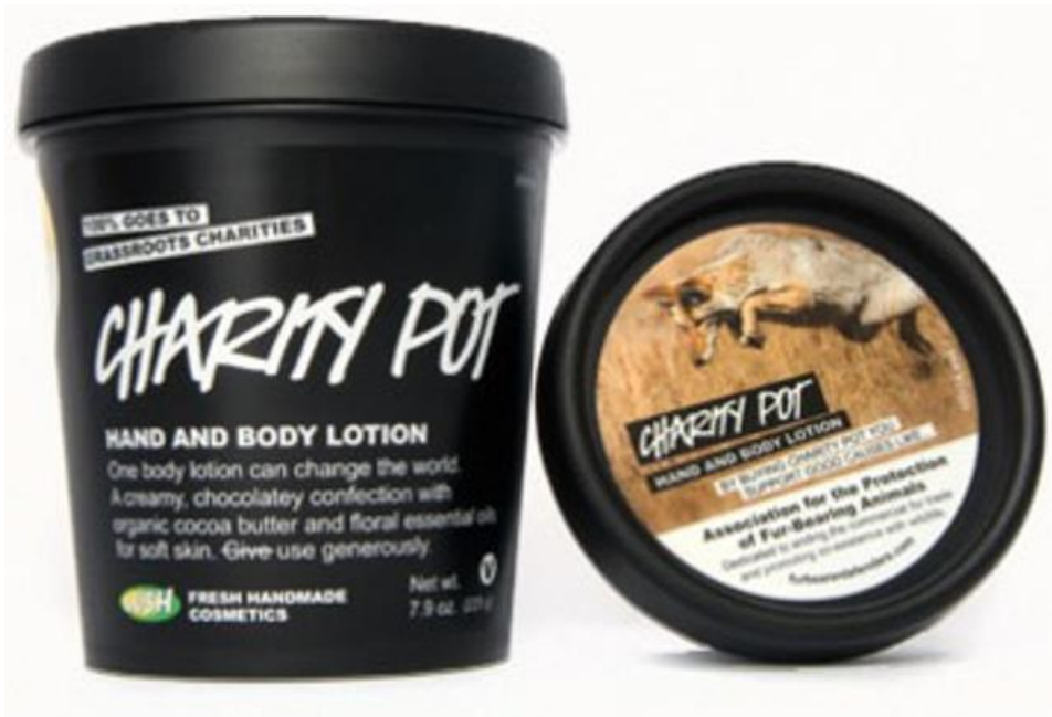
Figure 26. ( https://www.chickadvisor.com/item/lush-charity-pot/ )