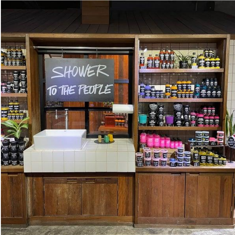
Figure 21.