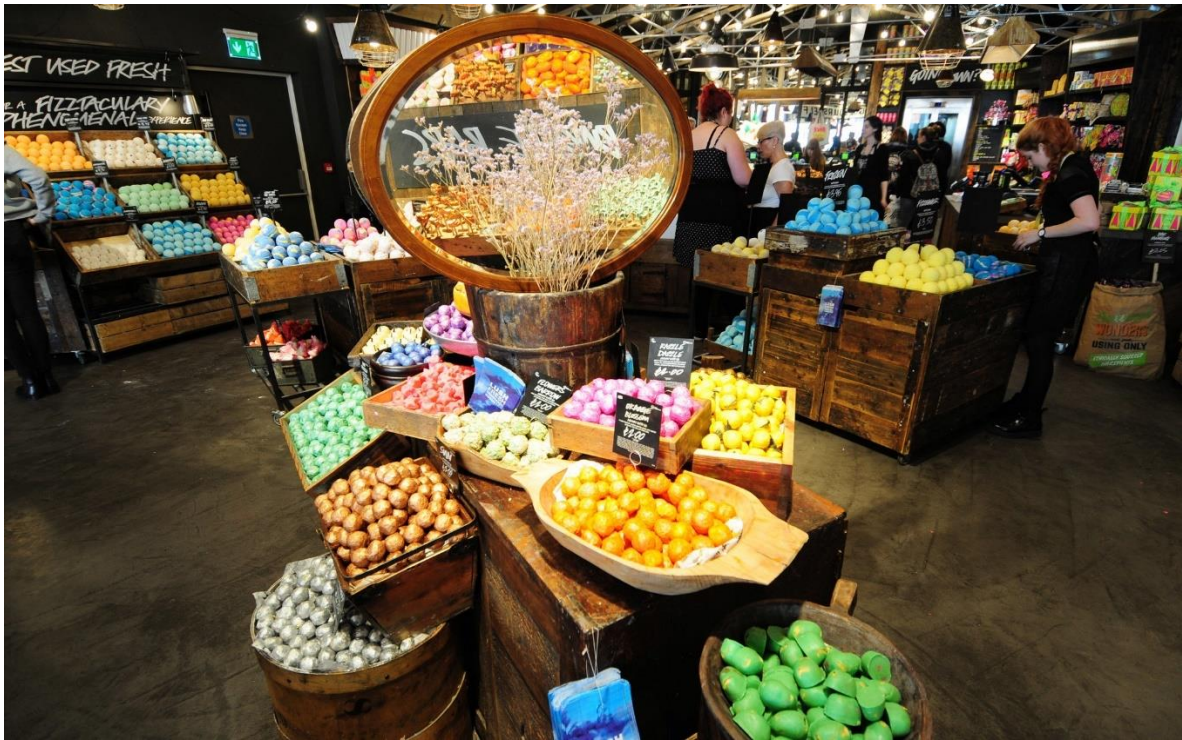
Figure 19. ( https://echochamber.com/article/lush-flagship-london/ )