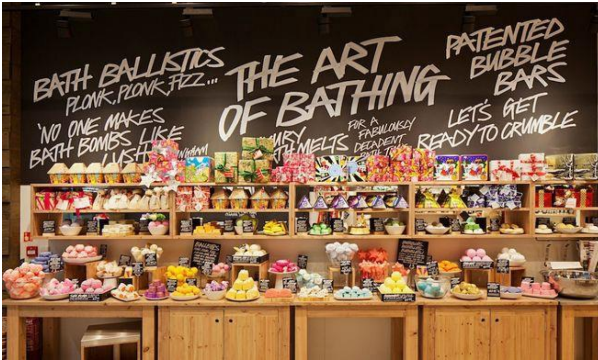
Figure 23. ( https://latana.com/post/lush-deep-dive/ )