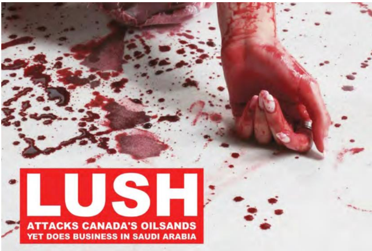
Figure 14. (Aronczyk, 13)