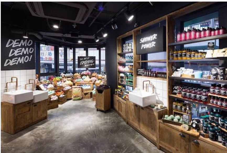
Figure 22. ( https://www.pinterest.com/pin/402157441728896092/ )