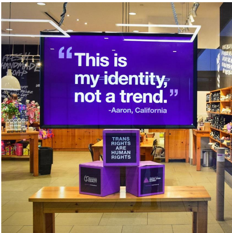
Figure 12. ( https://www.livekindly.com/vegan-friendly-beauty-company-celebrates-trans-rights/ )