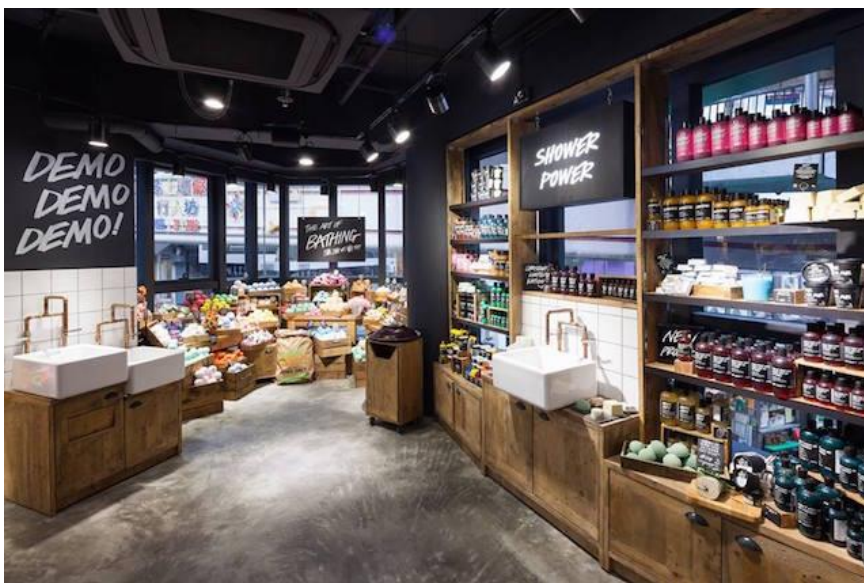
Figure 22. ( https://www.pinterest.com/pin/402157441728896092/ )