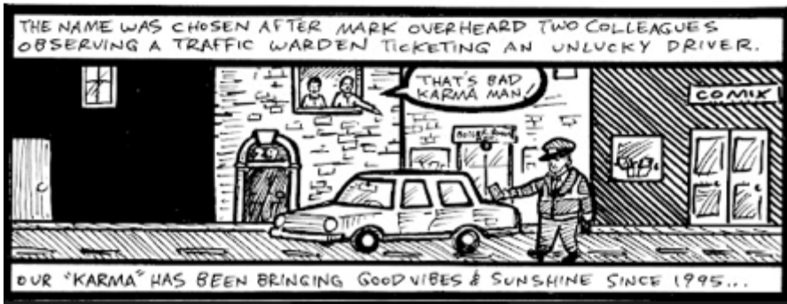
Figure 4. (Shared by Lush Facebook chat assistant upon inquiry.)