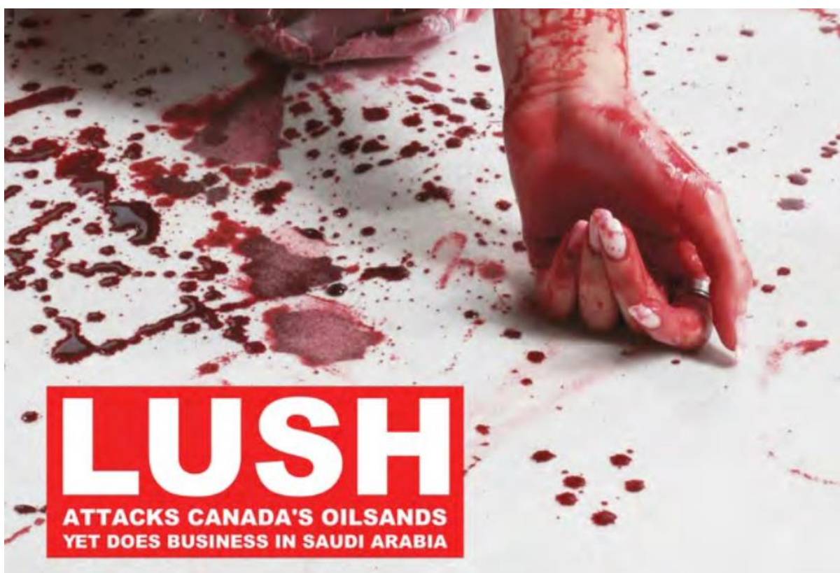
Figure 14. (Aronczyk, 13)