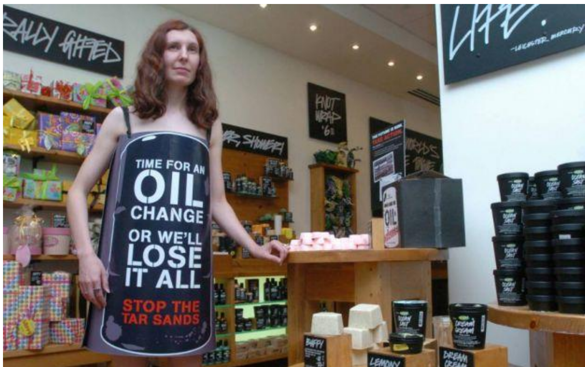
Figure 13. ( https://veganfeministnetwork.com/lush/ )