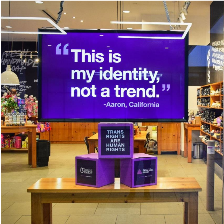
Figure 12. ( https://www.livekindly.com/vegan-friendly-beauty-company-celebrates-trans-rights/ )