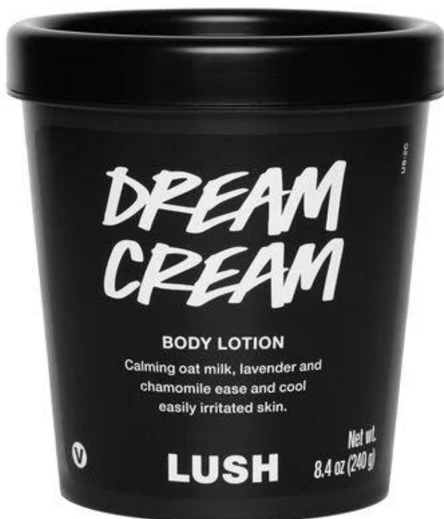
Figure 24. ( https://www.gq-magazine.co.uk/gallery/vegan-mens-grooming-products )