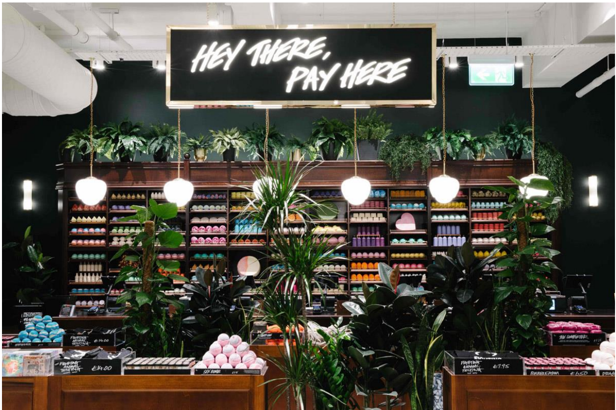
Figure 18. ( https://www.sbid.org/project-of-the-week-lush-liverpool/ )