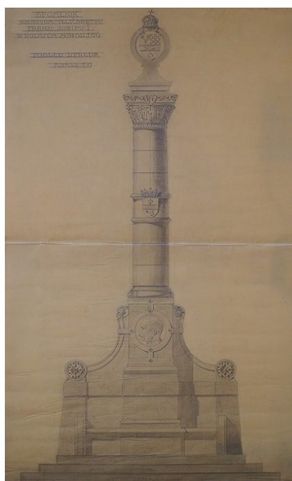
13 Herman Bollé, design for a monument to Franz Joseph I in Donji Miholjac, 1902. Croatian State Archives, Zagreb, Collection of Building Documentation, sign. XXXIII-1

monument. The design of the memorial was initially entrusted to Zagreb architect Herman(n) Bollé (1845–1926), a former student and long-term associate of Friedrich von Schmidt. 59 By that time Bollé had already realized a number of memorials, such as the above-mentioned Cross of Eugene of Savoy at Petrovaradin or the monument dedicated to the first visit by Franz Joseph I to Bosnia and Herzegovina (1885) which was erected in Bosanski Brod in 1887. 60 Bollé's design for Donji Miholjac envisaged a columnar monument standing on a tall, square pedestal. An oval at the top was to contain the coat of arms of the Triune Kingdom with the crown of St. Stephen, while the pedestal was to display a medallion with the emperor's portrait in low relief and Virovitica County's coat of arms in the middle (Fig. 13).