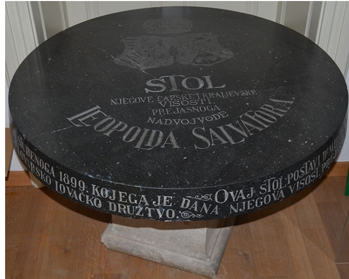
16 Memorial table built in 1903 in the Jasik Forest near Bjelovar, commemorating the pheasant hunt of Archduke Leopold Salvator in this forest in 1899. Bjelovar City Museum, Cultural-Historical Department, Collection of Furnishing, Inv.-Nr 1608