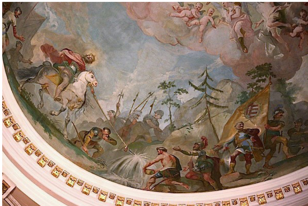
Fig. 8. Franz Anton Maulbertsch, St Ladislav striking water from a rock – detail, 1781, Bratislava, dome of the Bratislava bishop's palace chapel