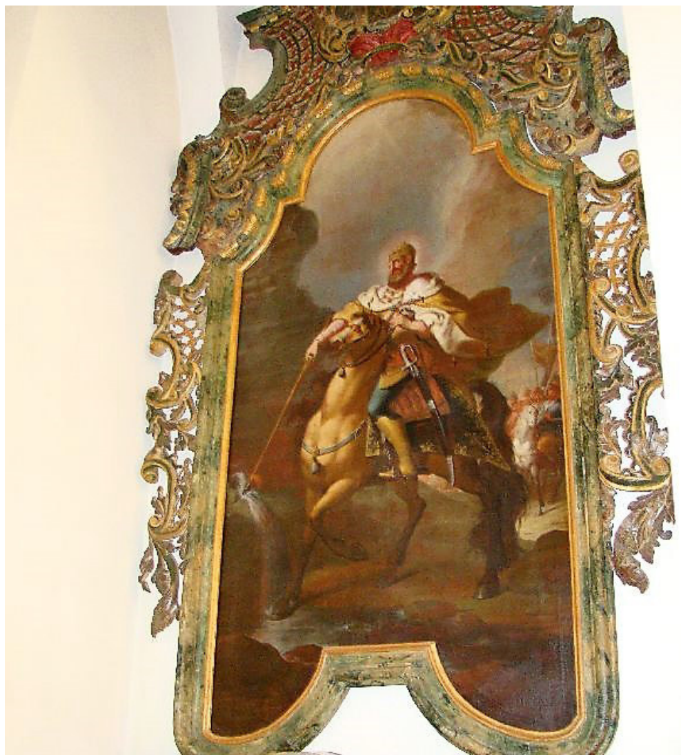
Fig. 7. Michael Angelo Unterberger (attributed to), St Ladislas striking water from a rock , ca. 1750, oil on canvas, Târgu Mureș, former Jesuit church of St John the Baptist, side altar