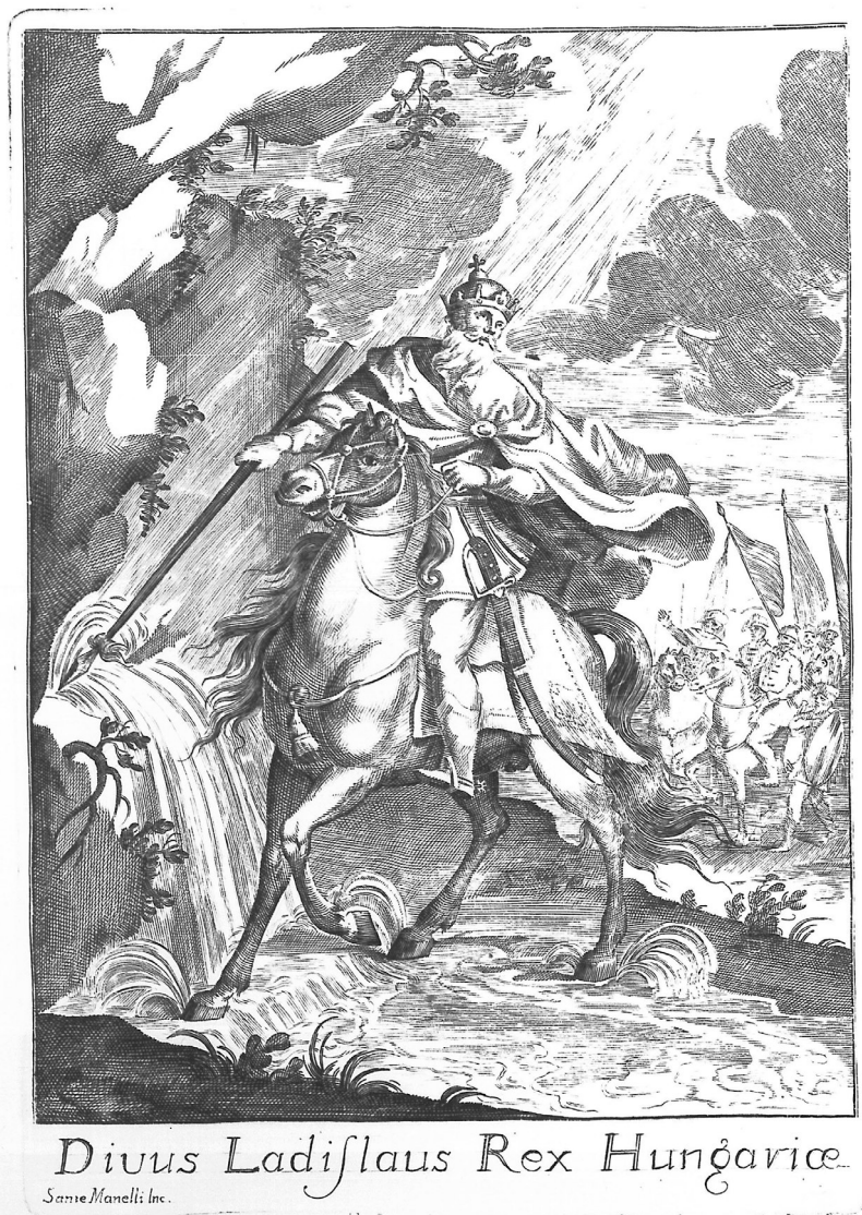
Fig. 3. Sante Manelli («Sante Manelli Inc.»), St Ladislaus striking water from a rock , 1738, engraving in Zaniboni 1738