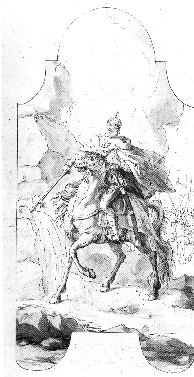
Fig. 9. Michael Angelo Unterberger (attributed to), St Ladislas striking water from a rock , ca. 1750, ink on paper, Innsbruck, Ferdinandeum