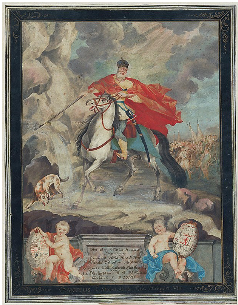
Fig. 6. Unknown painter, St Ladislaus striking water from a rock , 1737, watercolour on parchment, Bratislava, Galéria mesta Bratislavy