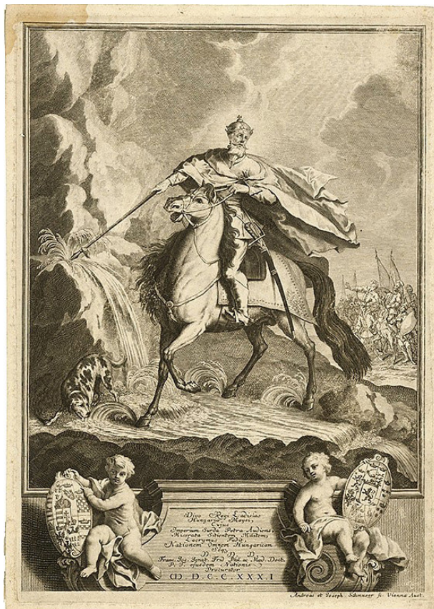
Fig. 5. Andreas and Joseph Schmutzer, St Ladislav unsealing a spring , 1731, engraving