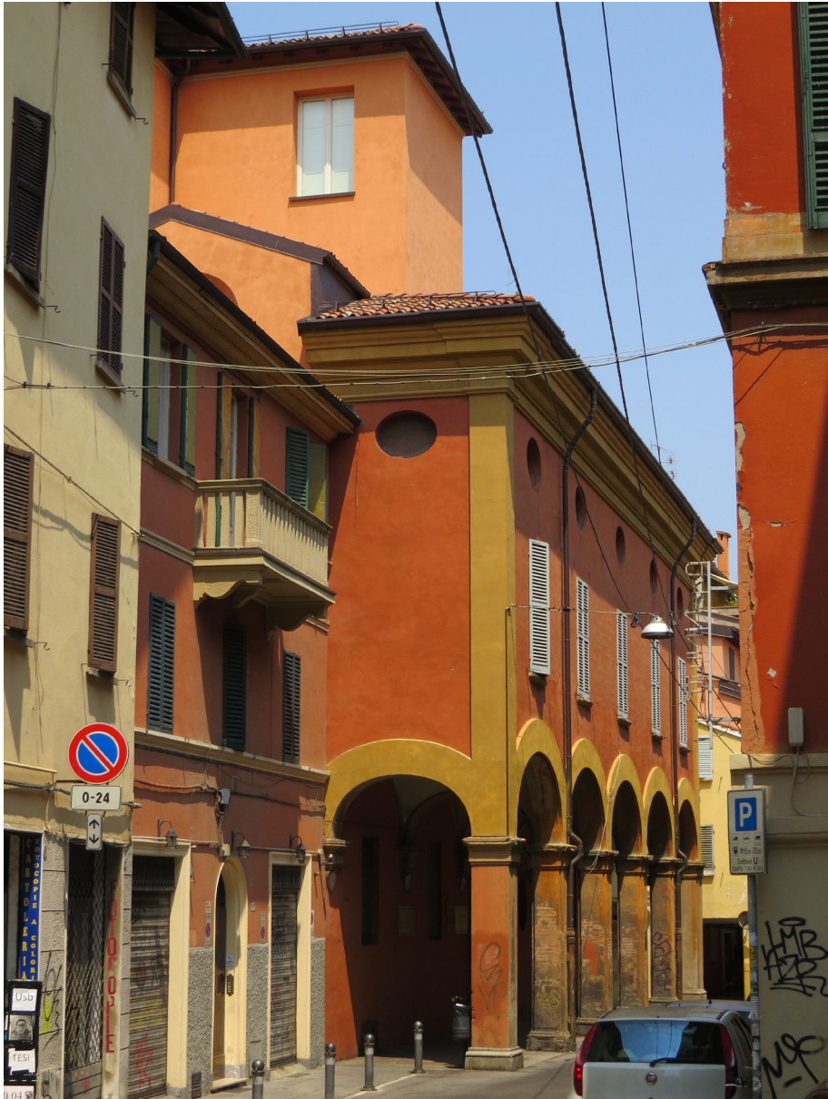
Fig. 1. Bologna, ex Illirian-Hungarian College