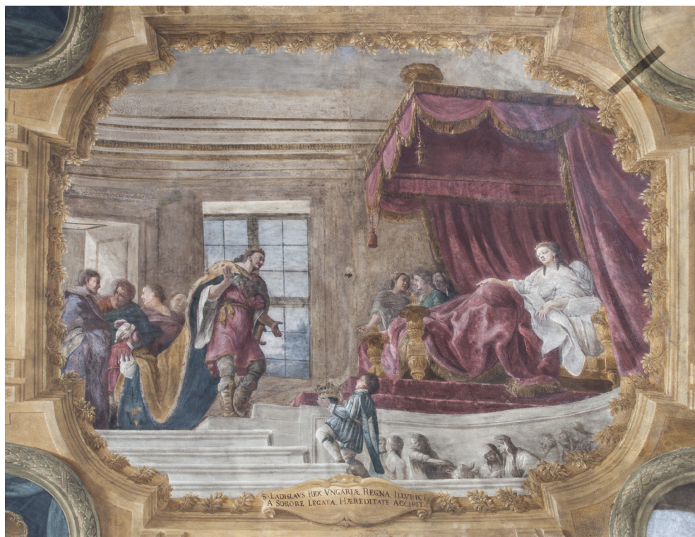
Fig. 2. Gioacchino Pizzoli, St Ladislav and queen Jelena , 1700, vault painting, Bologna, ex Illirian-Hungarian College (refectory)