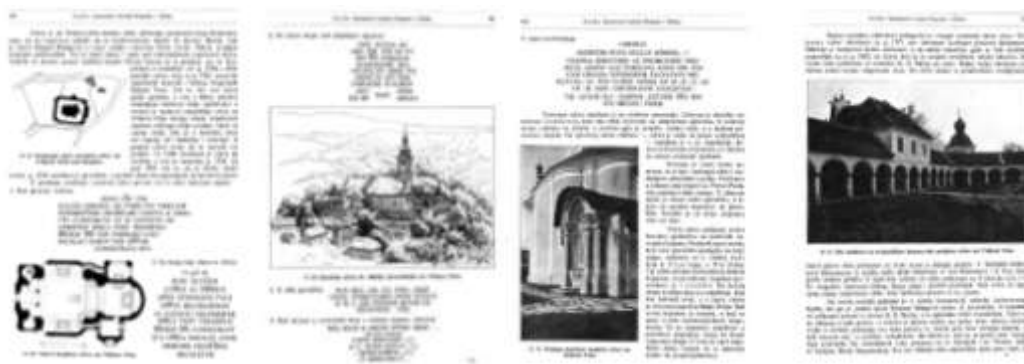
Figure 3 Szabo, 'Spomenici kotara Krapina i Zlatar, 160-161, (1919), Chapel in Trški Vrh

It is also important to mention that the high quality of the Reports... graphic design – which includes monuments' ground plans, drawings, and photographs of their interior and exterior – set it apart from other published work of that period. (figures 3 and 4) Although Szabo's Reports... were less polemical than some of his other work, such as the article On style... , his peculiar personal style and viewpoint, especially his critical stance on nineteenth-century art and Historicism, is still very much apparent: 'Everything that was painted in the nineteenth century should be identified as tasteless (the parish church in Zlatar, the arcaded walkway around the chapel in Trški Vrh, etc.).' 74