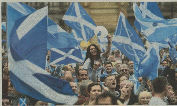
Zagovornici škotske samostalnosti vjeruju da će danas uspjeti biti brojniji od sunarodnjaka koji bi radile ostali u Uniji

Da stvari s Europskom unijom nisu ni izbliza jednostavne, još je jednom potvrdio španjolski premijer Mariano Rajoy. On je izjavio da bi neovisnost Škotske i Katalonije torpedirala Europsku uniju, a posljedice bi bile snažnije recesija i povećanje siromaštva. Što u posljednje vrijeme o neovisnosti Škotske govori