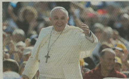
Papa Franjo ne namjerava zbog prijetnji mijenjati svoju dnevnu rutinu