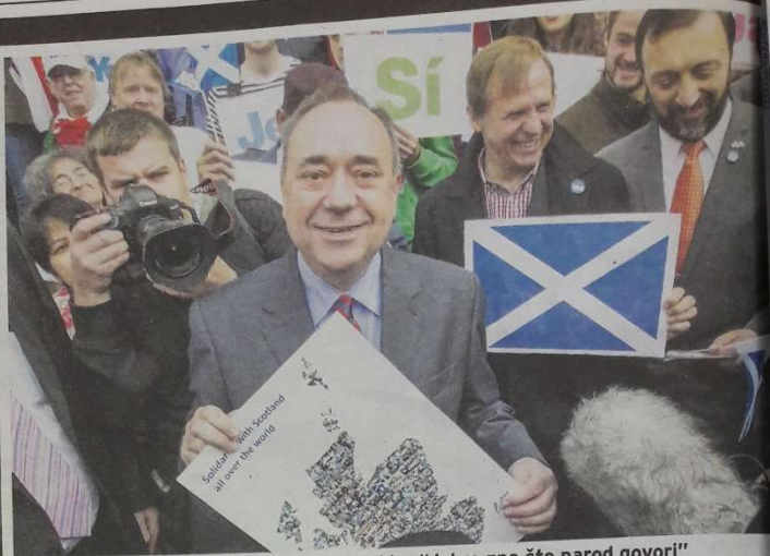
VRIJEME ODLUKE Alex Salmond, škotski premijer, uvjeren je da će postati neovisni jer "dobro zna što narod govori"

Cameron prijeti "kineskim zidovima" i nepopravljivim štetama , no Škoti kažu: "Nikamo ne idemo. Ostajemo tu, ali kao gospodari svoje sudbine"