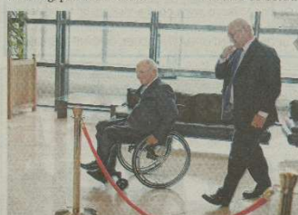
Njemački ministar financija Wolfgang Schäuble još se nije izjasnio o najavama francuskog kolege Michela Sapina