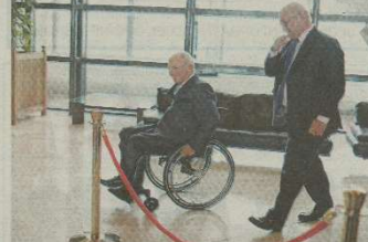
Njemački ministar financija Wolfgang Schäuble još se nije izjasnio o najavama francuskog kolege Michela Sapina