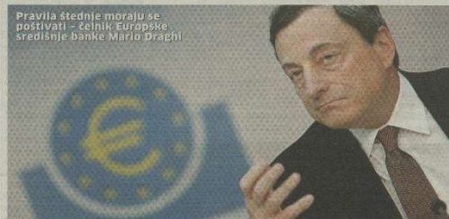
Pravila štednje moraju se poštivati – čelnik Europske središnje banke Mario Draghi

Francuska iduće godine neće spustiti svoj proračunski deficit ispod tri posto BDP-a, kako je bilo dogovoreno. I Italija traži fleksibilnije tumačenje štednje te veću investicijsku potrošnju