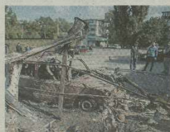
U Ukrajini je poginulo 30 osoba otkad je primirje na snazi

DONJECK ■ Dva civila ubijena su u pucnjavi u Donjecku, proruskom ustaničkom uporištu na istoku Ukrajine, objavile su u srijedu lokalne vlasti, dok je premijer Arsenij Jacenuk pozvao vojsku na punu borbenu spremnost. «Dvije civilne osobe ubijene su, a tri ranjene», objavila je gradska uprava, dan nakon što su ukrajinski zastupnici usvojili nacrt zakona koji daje više autonomije proruskim separatističkim područjima u okviru mirovnog protokola što su ga potpisali Kijev i separatisti. Zračna luka u Donjecku već je nekoliko dana poprište izmjene vatre. Vojska koja kontrolira infrastrukturu optužuje pobunjenike da pucaju na njezine položaje. Po brojkama agencije France presse, ukupno je do sada, otkad je na snagu stupio prekid vatre 5. rujna, poginulo 30 osoba, 14 civila i 16 vojnika. Vojska i pobunjenici međusobno prebacuju odgovornost za žrtve. Jacenuk je od ministarstva obrane zatražio da osigura da snage budu u punoj borbeno spremnosti, bez obzira na prekid vatre. «Rusija nam neće dati mira, zato tražim