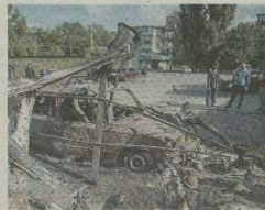
U Ukrajini je poginulo 30 osoba otkad je primirje na snazi

DONJECK ■ Dva civila ubijena su u pucnjavi u Donjecku, proruskom ustaničkom uporištu na istoku Ukrajine, objavilo se u srijedu lokalne vlasti, dok je premijer Arsenij Jaccenjuk pozvao vojsku na punu borbenu spremnost. «Dvije civilne osobe ubijene su, a tri ranjene», objavila je gradska uprava, dan nakon što su ukrajinski zastupnici usvojili nacrt zakona koji daje više autonomije proruskim separatističkim područjima u okviru mirovnog protokola što su ga potpisali Kijev i separatisti. Zračna luka u Donjecku već je nekoliko dana poprište izmjene vatre. Vojska koja kontrolira infrastrukturu optužuje pobunjenike da pucaju na njezine položaje. Po brojkama agencije France presse, ukupno je do sada, otkad je na snagu stupio prekid vatre 5. rujna, poginulo 30 osoba, 14 civila i 16 vojnika. Vojska i pobunjenici međusobno prebacuju odgovornost za žrtve. Jaccenjuk je od ministarstva obrane zatražio da osigura da snage budu u punoj borbeno spremnosti, bez obzira na prekid vatre. «Rusija nam neće dati mir, zato tražim