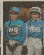
Novinarka Jutarnjeg u Edinburghu (lijevo). Članovi iste obitelji (gore) ne mogu se usuglasiti oko odgovora