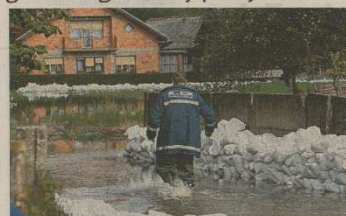
Šest mjeseci nakon katastrofalnih poplava, Hrvatska opet pod vodom

Probleme također očekujemo i u mjestu Sveti Đurad kod Donjeg Mitholaja, gdje je potencijalno ugroženo šest kuća u najnižem dijelu naselja - rekao je Haničar, dodavši