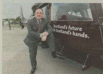
Učinimo to! – škotski premijer Alex Salmond

ške, ratne mornarice i ratnog zrakoplovstva. Fikcija je govoriti o regionalnim oružanim snagama. Podjela Ujedinjenog Kraljevstva može ili ne mora biti politički ili ekonomski osjetljiva, ali vojno gledano sve je jasno: ona će nas sve oslabiti, poručuju bivši vojni zapovjednici u zajedničkom pismu. U Škotskoj se dugo očekivalo i kako će se o referendumu izjasniti škotsko izdanje Suna, tamošnjeg najtraženijeg dnevnog lista. Na kraju se Sun nije izjasnio ni za ni protiv i poručio biračima da je riječ o njihovom glasu i njihovom izboru.